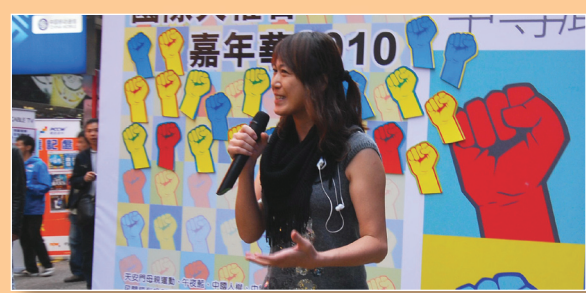
Transgender Resource Center on International Human Rights Day.