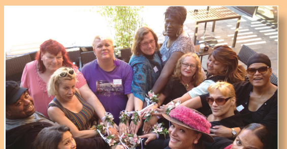
Members of Transgender Gender Variant & Intersex Justice Project.