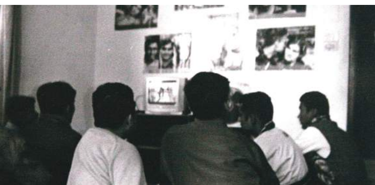
A gathering of constituents at the first BDS office in 2002.

security: "...BDS has been providing different kinds of opportunities for the community members themselves to come and gather and share their experiences, and through their experiences [to] create an awareness among themselves about their own sexuality, their gender, and their basic human rights..." 23