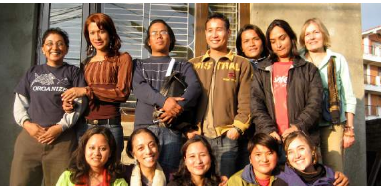
Members of Mitini Nepal and Blue Diamond Society meet with international representatives in 2007.

While the HIV/AIDS epidemic in many ways forced the issue for reluctant governments to discuss sexuality and, specifically, at-risk populations such as men who have sex with men (MSM) in ways that at least partially avoided official or public condemnation or violence, service gaps remain. 34 Research on HIV funding streams in some countries that criminalize homosexual conduct has revealed significant blind spots concerning male sexual health. 35 Such tepid engagement may have strategic value, however. For example, the distribution of personal lubricants, which have been deemed an essential commodity for safe anal sex, is more difficult in countries with anti-gay laws. Nonetheless, development agencies have managed through the matrix of HIV programing—effective distribution by framing it as a public health commodity. 36