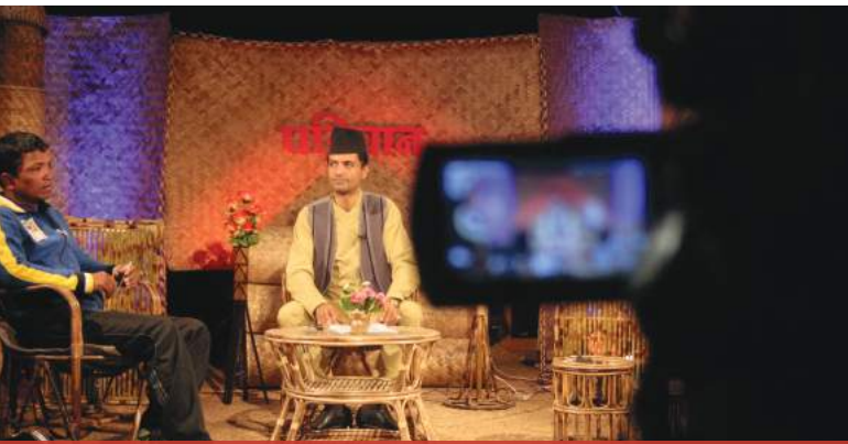
The cast of Pahichaan, a weekly prime-time TV talk show, prepares to film an episode.

A prime-time television show called Pahichaan (“Identity” in Nepali) launched in 2011 and further vaulted LGBTI people and rights into the public sphere. Activists invited celebrities to join them on the weekly program. Said one guest, a movie star: “There is still some discrimination against LGTB people, but I didn’t hesitate to be a guest on this show. This TV programme gives the country an opportunity to discuss these things in their homes.” 146 In 2012 the program was spun into an FM radio show, 147 which commentators have noted is an important medium in Nepal that “transcends literacy, load shedding [routine power outages], poverty, even geography.” 148