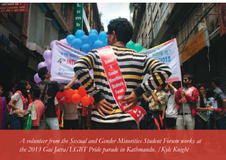
A volunteer from the Sexual and Gender Minorities Student Forum works at the 2013 Gai Jatra/LGBT Pride parade in Kathmandu.

Cameron's speech set the stage for what he admitted was a difficult but crucial path to including LGBTI people in basic rights protections: