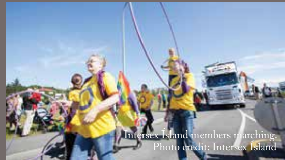
Intersex Island members marching.

Intersex Ísland was founded in 2014 to provide a safe space for intersex individuals, to educate the public about intersex issues, and to advocate for the principles outlined in the Malta Declaration. Among their first tasks was addressing the invisibility of intersex people in Iceland. An attitude of secrecy encouraged by the medical establishment and a lack of information in Icelandic language made “intersex” an almost unheard-of term. At the time of the organization’s founding, there existed only five pieces of writing on intersex issues in Icelandic and that were easily accessible to the public. This meant that Iceland had almost no non-medical discourse on intersex issues and that intersex people and their families felt disempowered to discuss their needs in the local language, often resorting to English. Intersex Ísland worked with a team of linguistic experts to develop a language base of non-pathologizing intersex terminology and, through public education and political advocacy, has been shaping an alternative discourse around intersex in the Icelandic language.