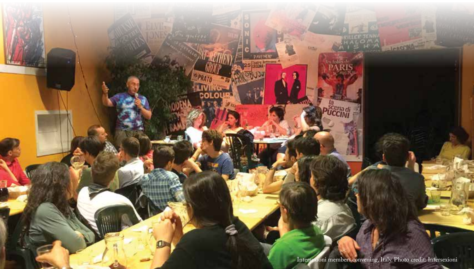
Intersexioni members convening, Italy.

“Sex characteristics” or “intersex traits” are terms used when referring to the features that make a person intersex; those terms have also been used in national legislation to protect the rights of intersex people. In some places, “inter*” is used to denote the diversity of intersex realities and bodies.