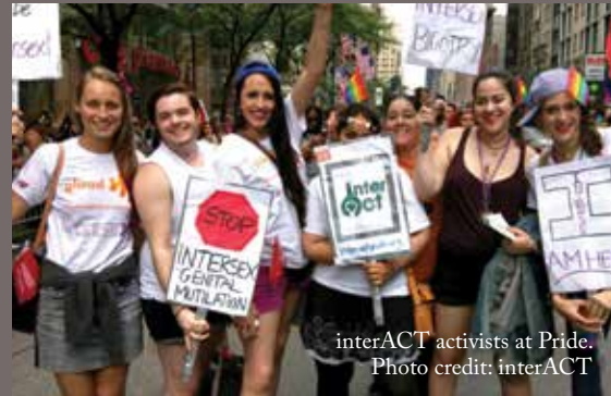
interACT activists at Pride.

interACT (formerly Advocates for Informed Choice) is based in the United States. This year, interACT is celebrating ten years of advocating for the human rights of children born with intersex traits