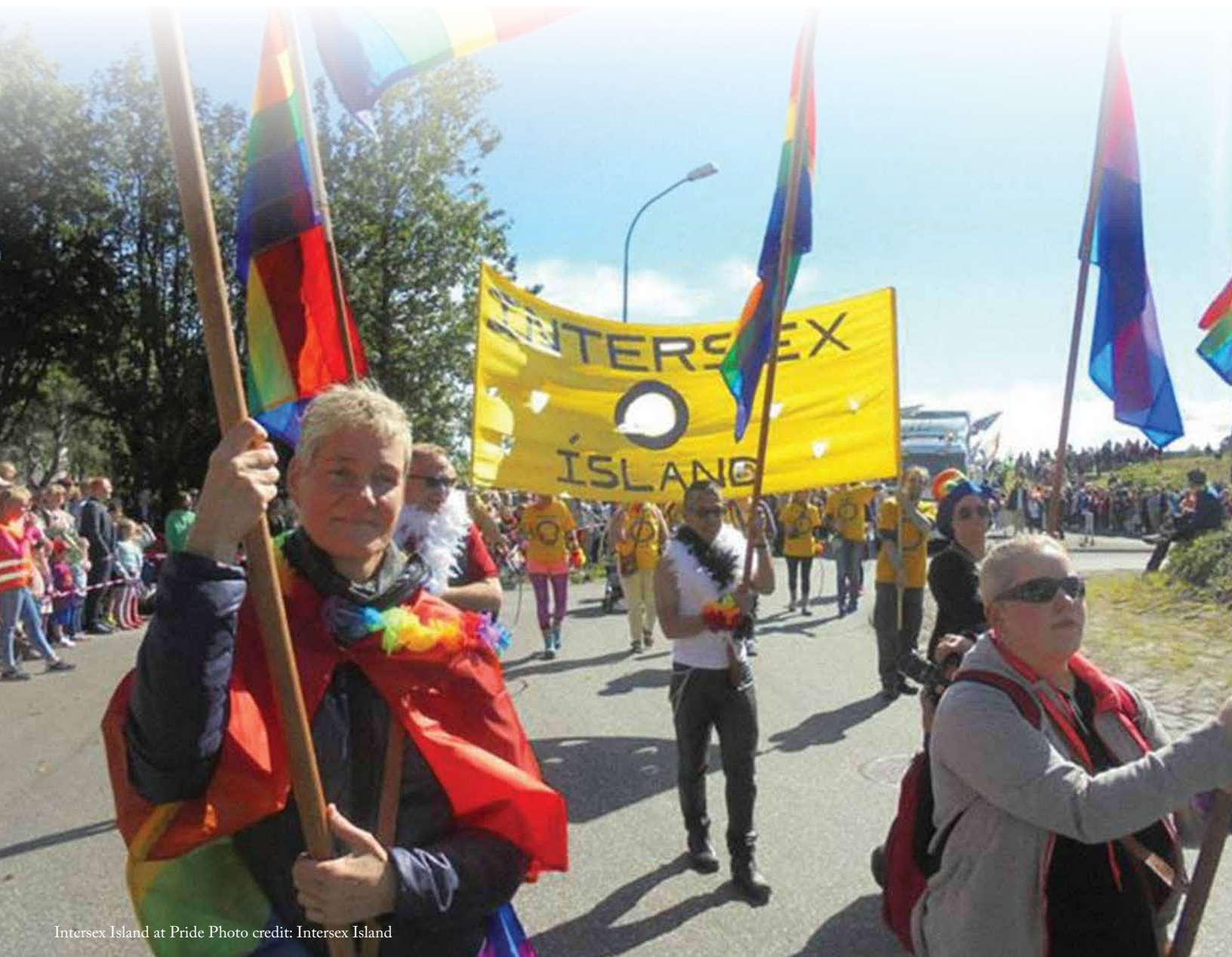
Intersex Island at Pride

We hope that this report serves as another stepping-stone towards further research, resourcing and recognition of this growing and vibrant movement.