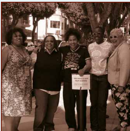
Below: QWOCMAP staff and members

Pride at Work/AFL-CIO (Washington, DC) mobilizes support between the organized Labor movement and the LGBT community to achieve social and economic justice. The alliance is instrumental in recruiting Labor to support LGBT rights through non-discrimination policies and domestic partner benefits, promoting an end to civil marriage discriminations, and extending health benefits to transgender people. $6,000 prideatwork.org