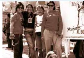
Left: Grupo de Mujeres Safo member Center: Desdenosotras banner at LGTTTB pride march Right: Mujeres al Borde's Festival de la diversidad Below: Reading books at the SKUC-LL Lesbian Library March