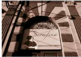
Left: Helem members Center: Kontra logo Right: La Serafina's new building Below: CSRAT members