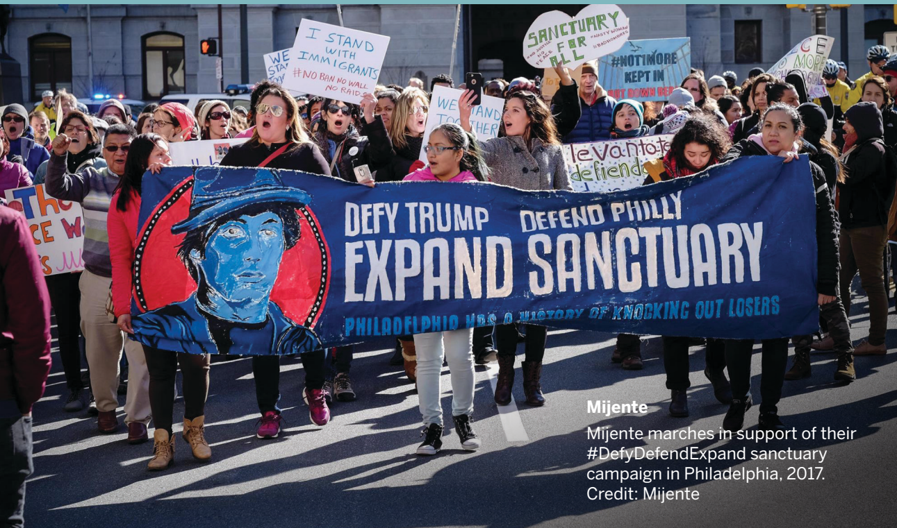
Mijente Mijente marches in support of their #DefyDefendExpand sanctuary campaign in Philadelphia, 2017.

approved by the country's Chamber of Deputies and is now awaiting a Senate decision.