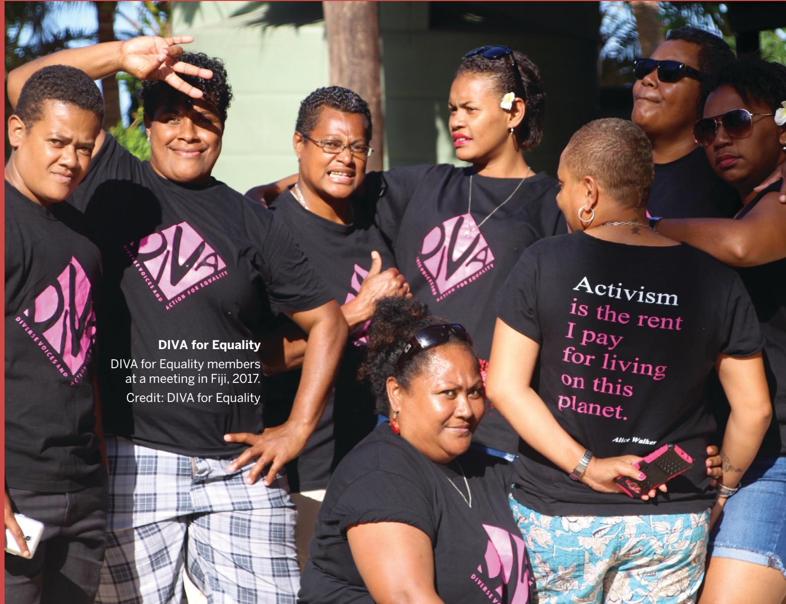
DIVA for Equality DIVA for Equality members at a meeting in Fiji, 2017.

Jewish Voice for Peace Oakland, CA, U.S.