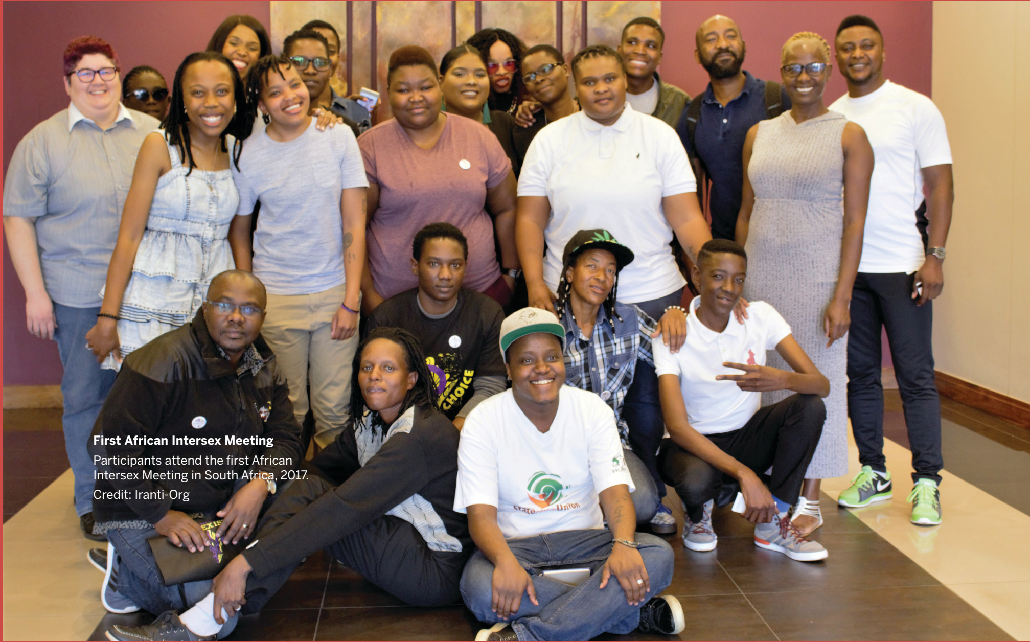
First African Intersex Meeting Participants attend the first African Intersex Meeting in South Africa, 2017.