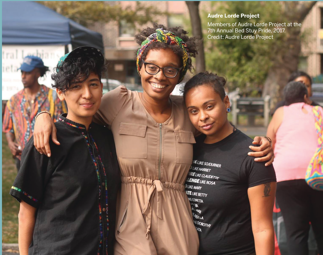
Audre Lorde Project

Members of Audre Lorde Project at the 7th Annual Bed Stuy Pride, 2017.