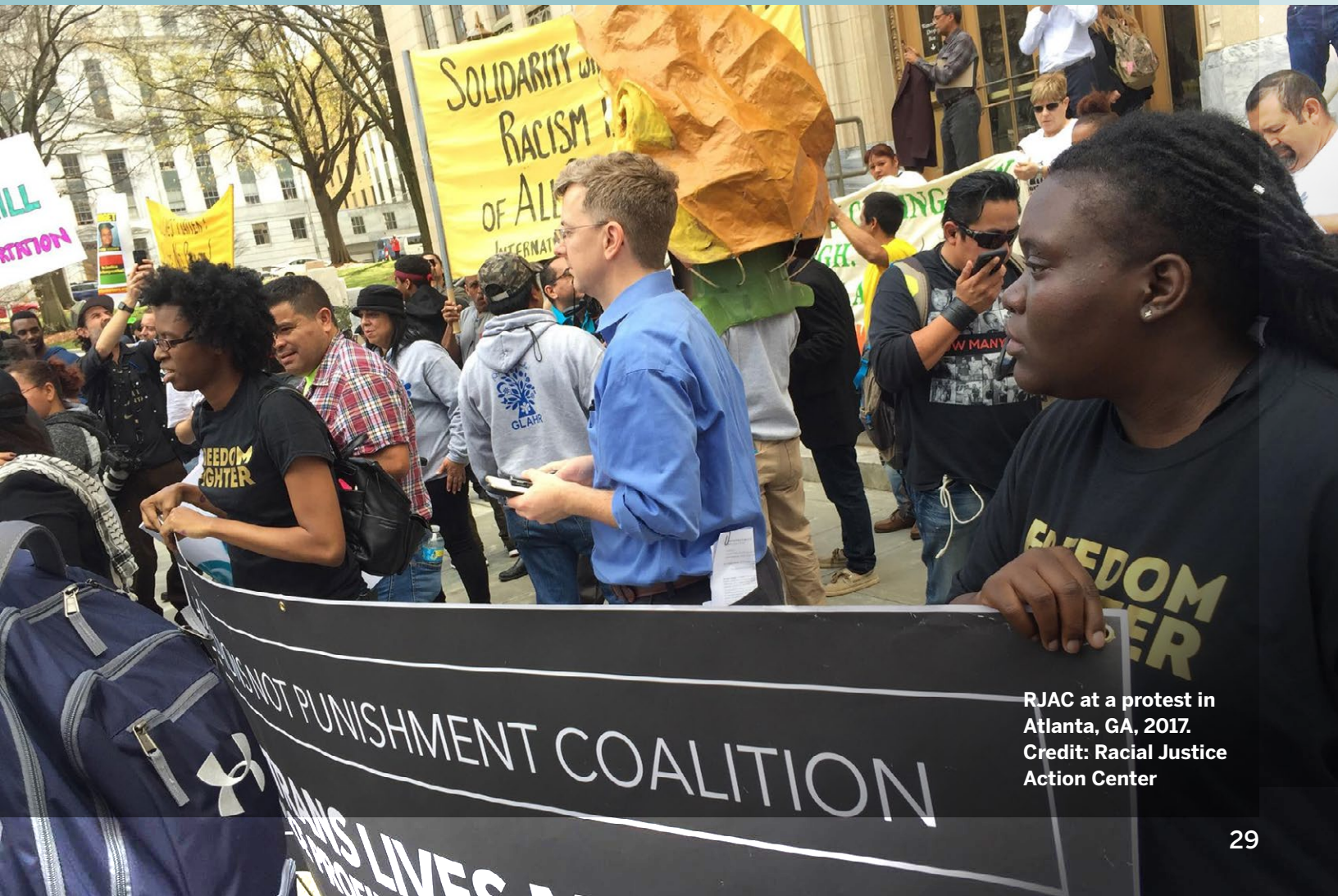
RJAC at a protest in Atlanta, GA, 2017.

The Racial Justice Action Center is a multiracial organizing and training center working to build the grassroots leadership and power of communities of color and low income communities. The organization collaboratively provides resources and training toward leadership which transforms individuals, communities, and societies. Their work is fundamentally rooted in healing justice and uses this approach to help activate leaders to mediate, mitigate, and interfere with projections of anger and fear in the current political moment.