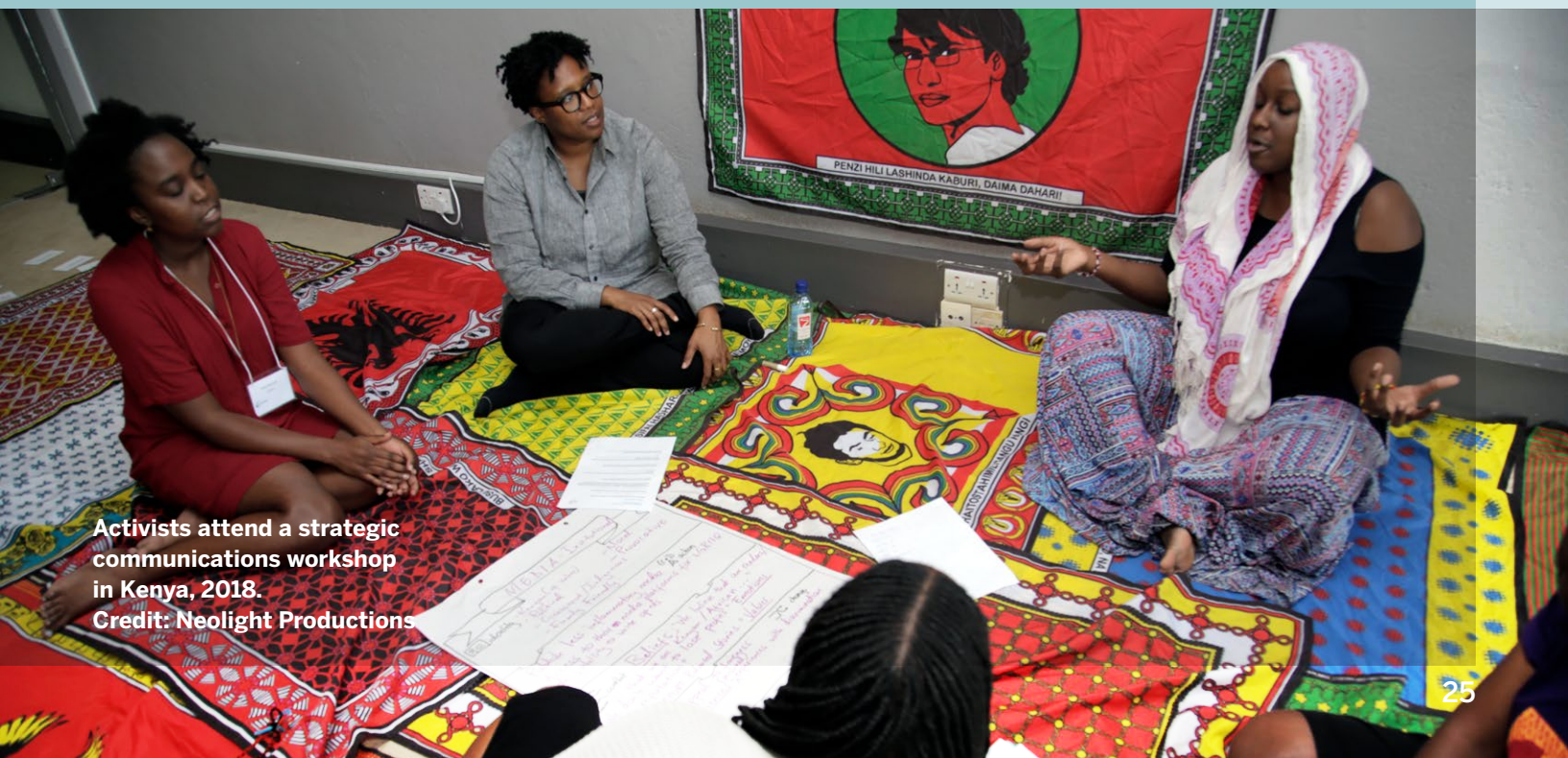
Activists attend a strategic communications workshop in Kenya, 2018.

The research revealed many surprises: activists witnessed the impact of stories as people's mindsets began to change and they expressed an openness to learning about and supporting LGBTQI people in their communities. The project uncovered new opportunities to reach potential supporters with targeted messaging that uplifts shared Kenyan values. Kenyan activists are using these skills across their varied approaches to their work; from accompanying advocacy efforts challenging colonial-era laws used to criminalize LGBTQI communities to strengthening their community organizing.