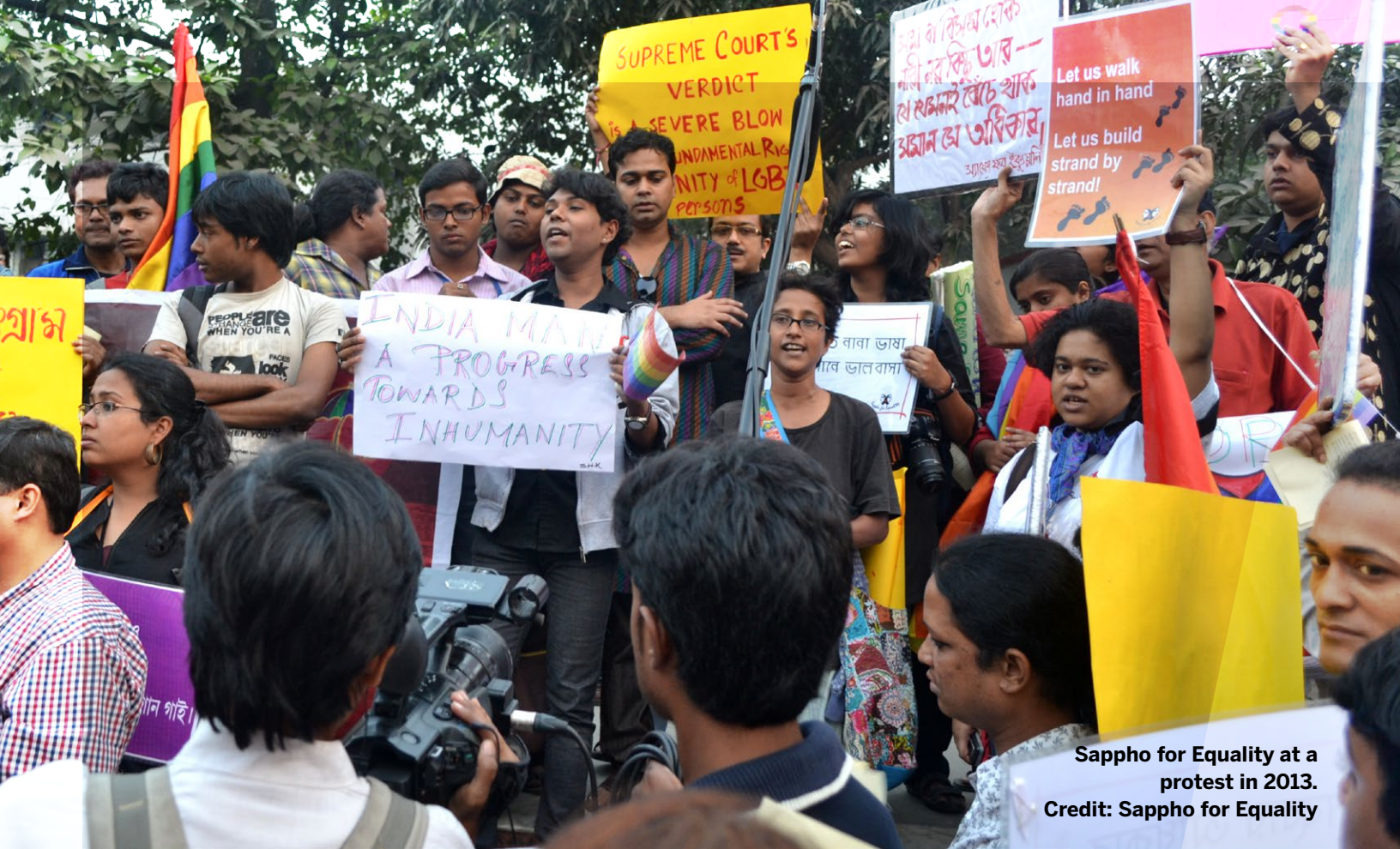
Sappho for Equality at a protest in 2013.