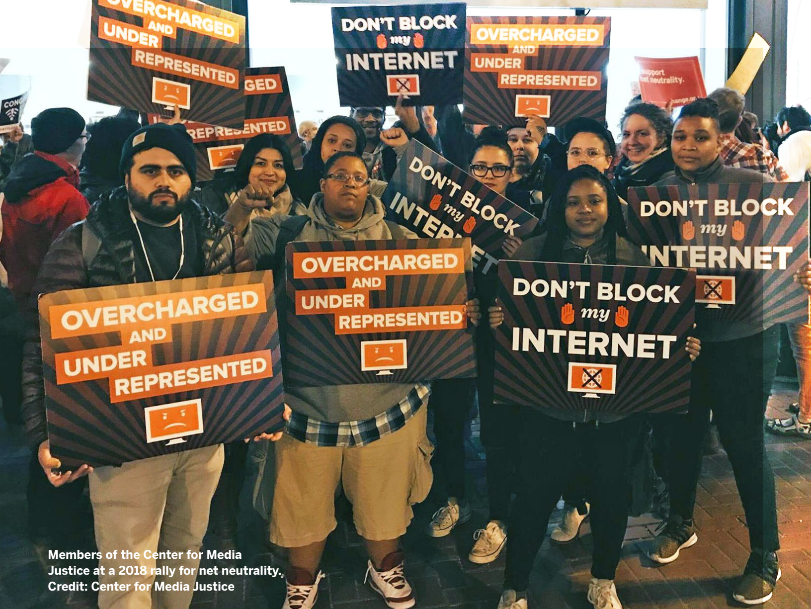
Members of the Center for Media Justice at a 2018 rally for net neutrality.