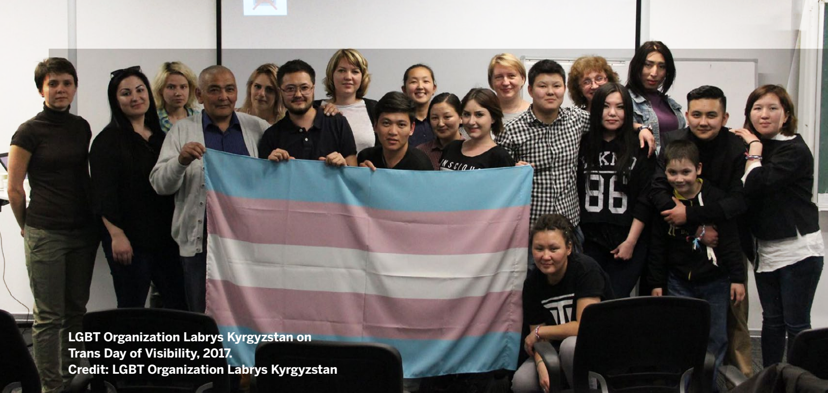
LGBT Organization Labrys Kyrgyzstan on Trans Day of Visibility, 2017.