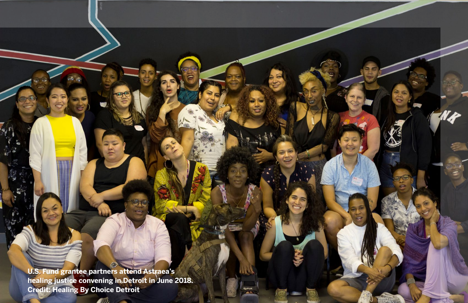
U.S. Fund grantee partners attend Astraea's healing justice convening in Detroit in June 2018.