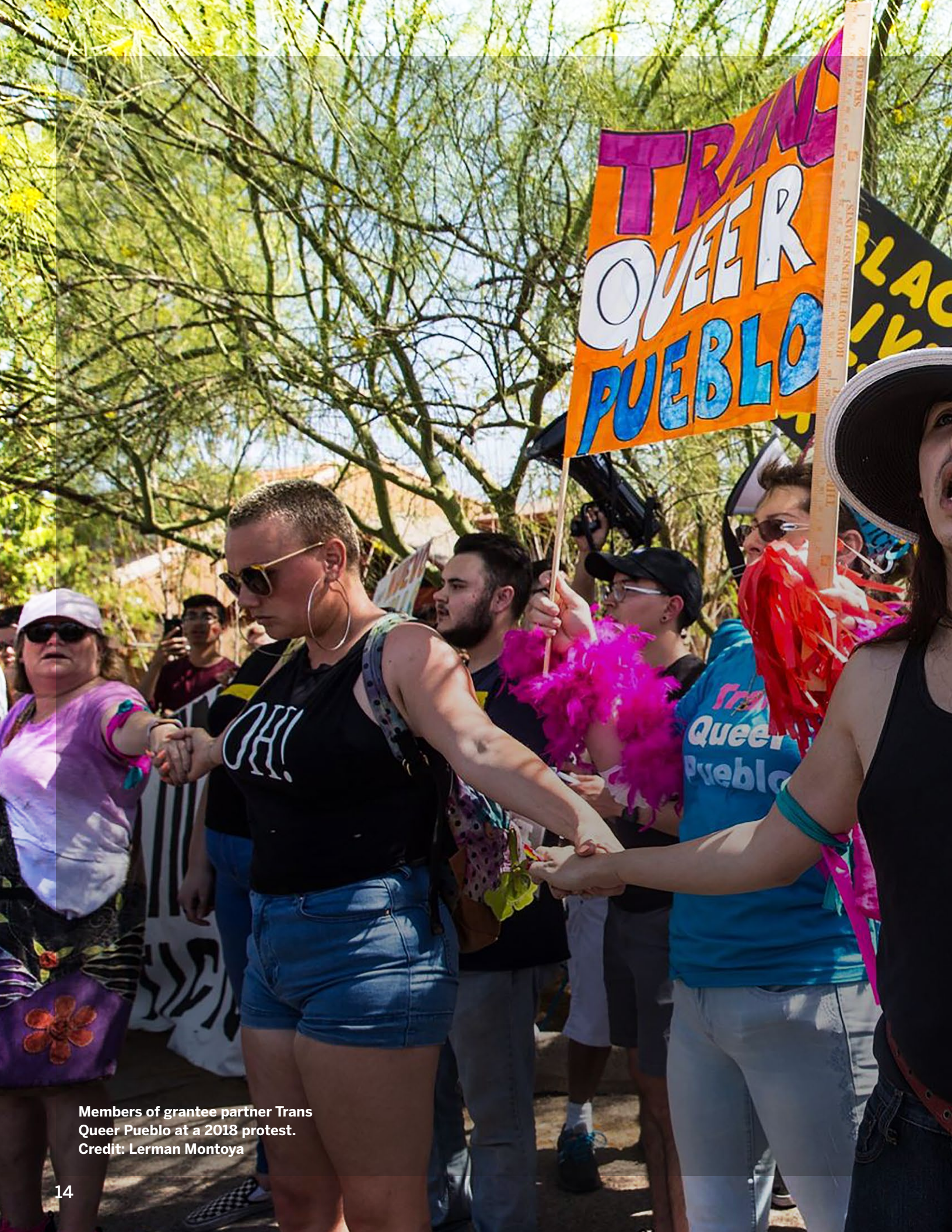
Members of grantee partner Trans Queer Pueblo at a 2018 protest.