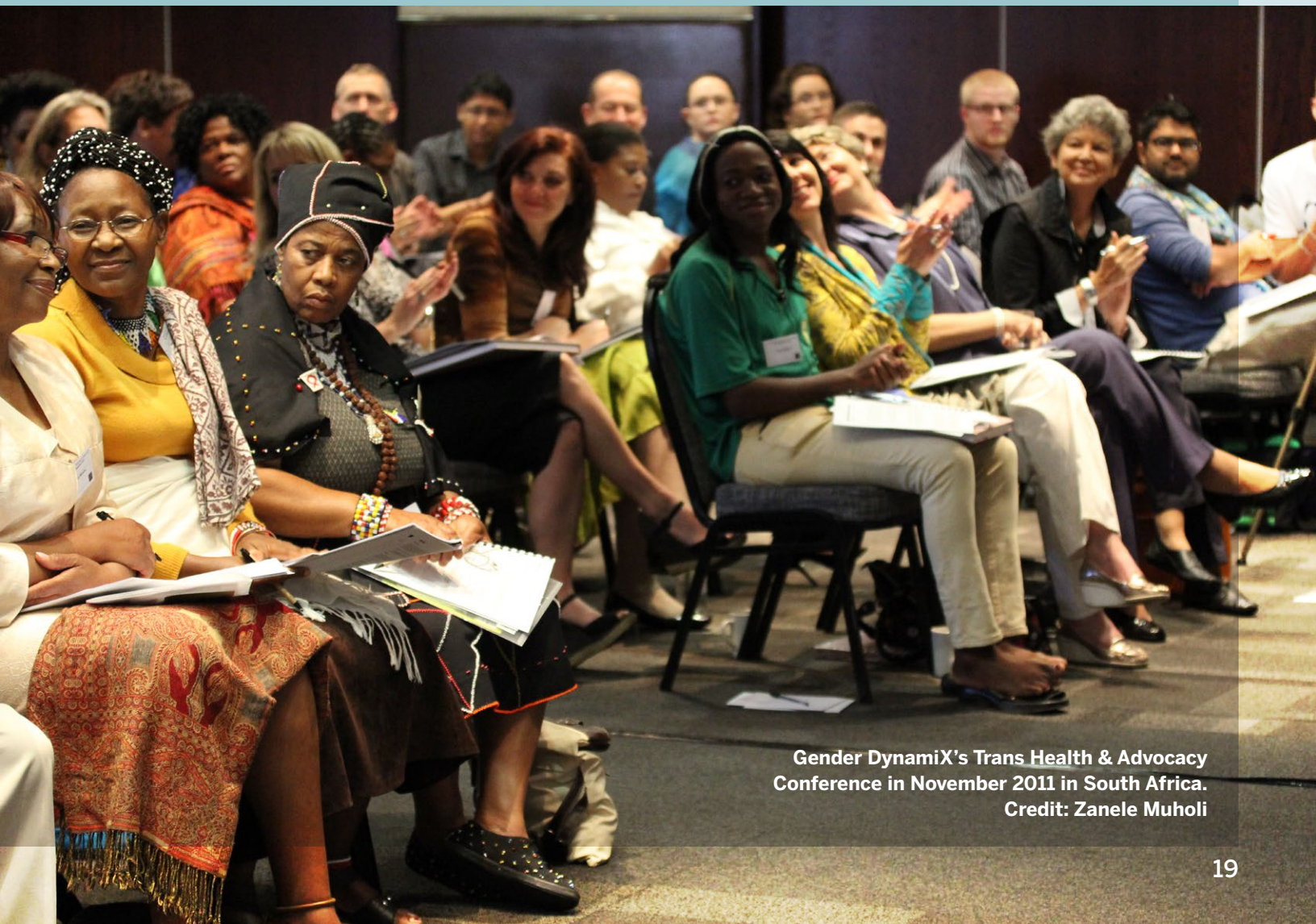
Gender DynamiX's Trans Health & Advocacy Conference in November 2011 in South Africa.

Through their resilience and commitment to achieving legal and personal self-determination for trans and intersex people in and across the Southern Africa region, Gender DynamiX continues to set the tone for envisioning trans and intersex rights across South Africa and the continent at large. The organization is currently focused on redrafting South Africa's gender recognition law to fully incorporate fundamental rights for diverse trans people, a win which could serve as inspiration for groups across the African continent. Gender DynamiX is galvanizing, coordinating, and consolidating support across human rights movements, ensuring that protecting trans and intersex folks should be a priority for all human rights activists.