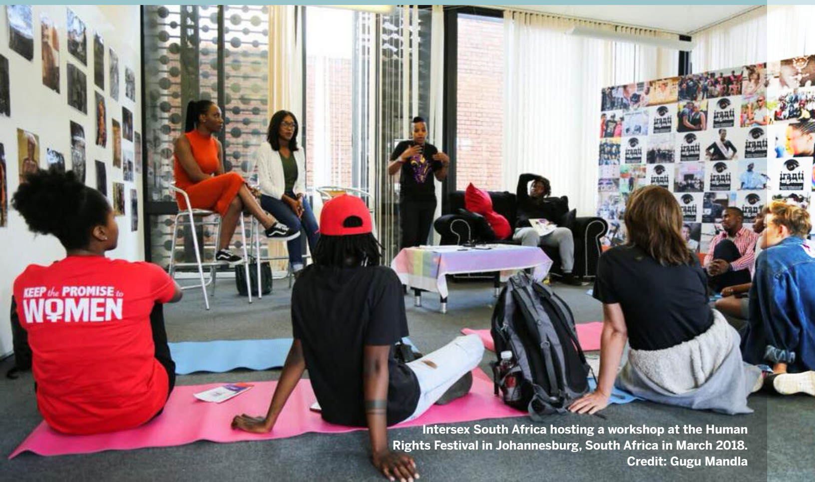
Intersex South Africa hosting a workshop at the Human Rights Festival in Johannesburg, South Africa in March 2018.