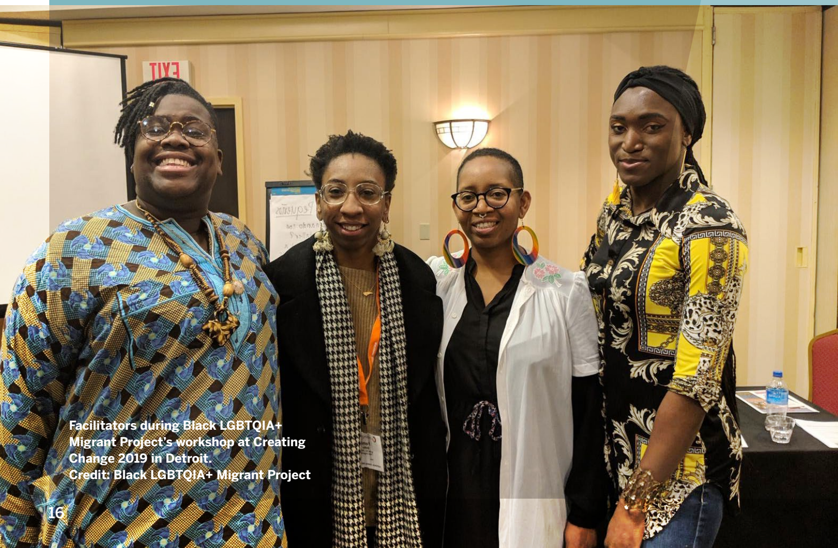
Facilitators during Black LGBTQIA+ Migrant Project's workshop at Creating Change 2019 in Detroit.

The Black LGBTQIA+ Migrant Project was formed in response to the invisibilization of Black LGBTQIA migrants' experiences of being undocumented, queer, and Black within migrant narratives, immigration justice, and racial justice movements. At a time when separating families has become blatant government policy in the U.S., BLMP is working to connect people, build together, and create collective safety mechanisms. Working at the local, regional, and national level to address intensifying attacks on their communities, they organize community and movement building events around the country to reduce isolation, create support systems for trans and queer Black migrants, and build leadership and local power.