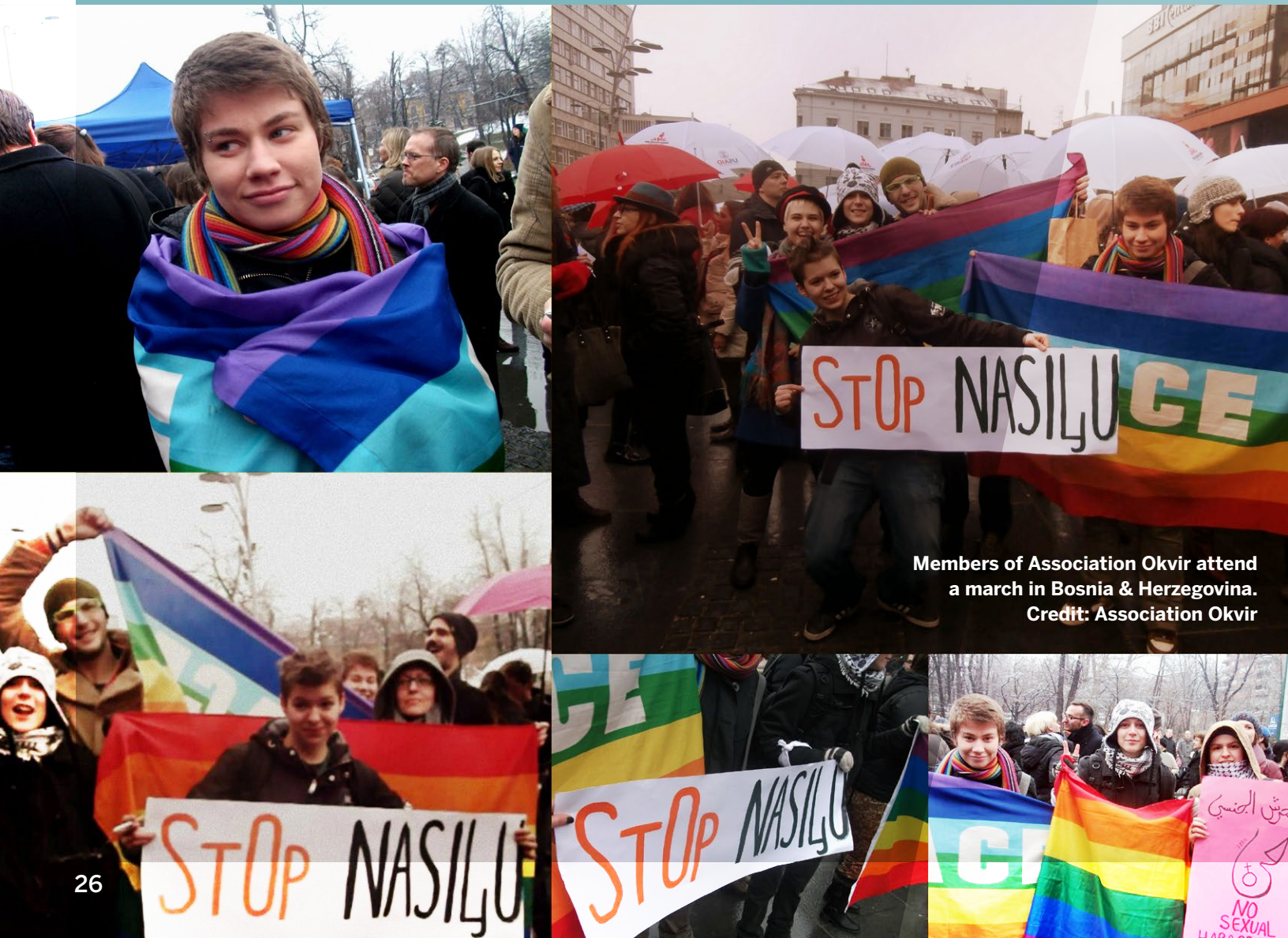
Members of Association Okvir attend a march in Bosnia & Herzegovina.

Association Okvir supports LGBTIQ+ communities in reclaiming public space in Bosnia and Herzegovina (BiH) through community building, cultural production, activism, and alliance building. Working with a feminist “multiple discriminations” approach, Okvir roots its work in the intersections of sex, gender, race, class, ethnicity, age, and ability. In line with its efforts to increase LGBTIQ+ visibility and knowledge in public space, Okvir launched Queer Archive this year. The digital media project hosts a collection of historical narratives and counter-narratives about LGBTIQ+ activism and life during the war and transitional period in the former Yugoslavia.