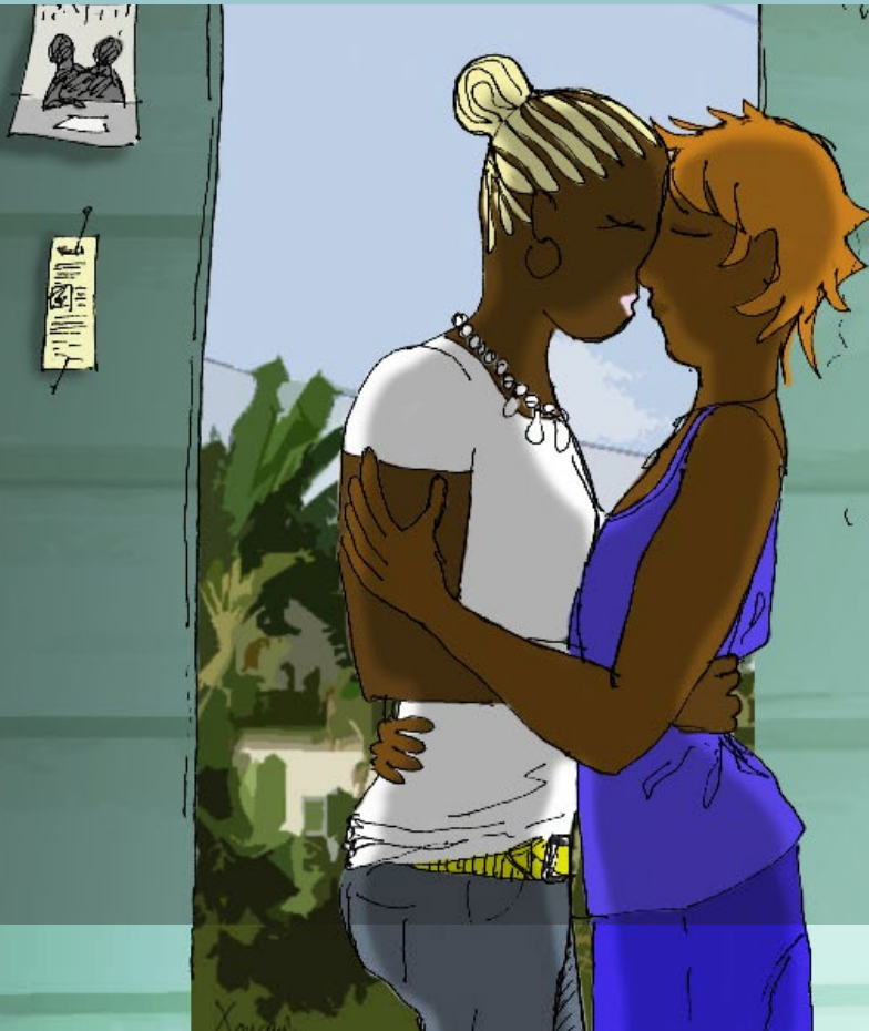
Illustration from QAYN's 2015 magazine, Q-zine. Credit: Queer African Youth Network (QAYN)

The Queer African Youth Network (QAYN) is a queer, feminist, women-led network that came together to support the leadership of young LBQ women in West Africa. Their work has grown to focus more broadly on strengthening LGBTQ organizing in West Africa and Cameroon and is holding strong to the support and growth of lesbian, bisexual, and queer (LBQ) women's leadership, building a base of social justice movement support for LGBTQ issues and promoting a cultural shift, and improving policy and legal environments. They hold space for LBQ leaders to meet, collaborate, and learn in order to build relationships and lay the groundwork for lasting change. Over the last couple of years, QAYN continued with their work to build the institutional capacity of member and non-member organizations and with Astraea's support, QAYN has recently been able to bolster and strengthen several nascent young LBQT women's groups in West Africa.