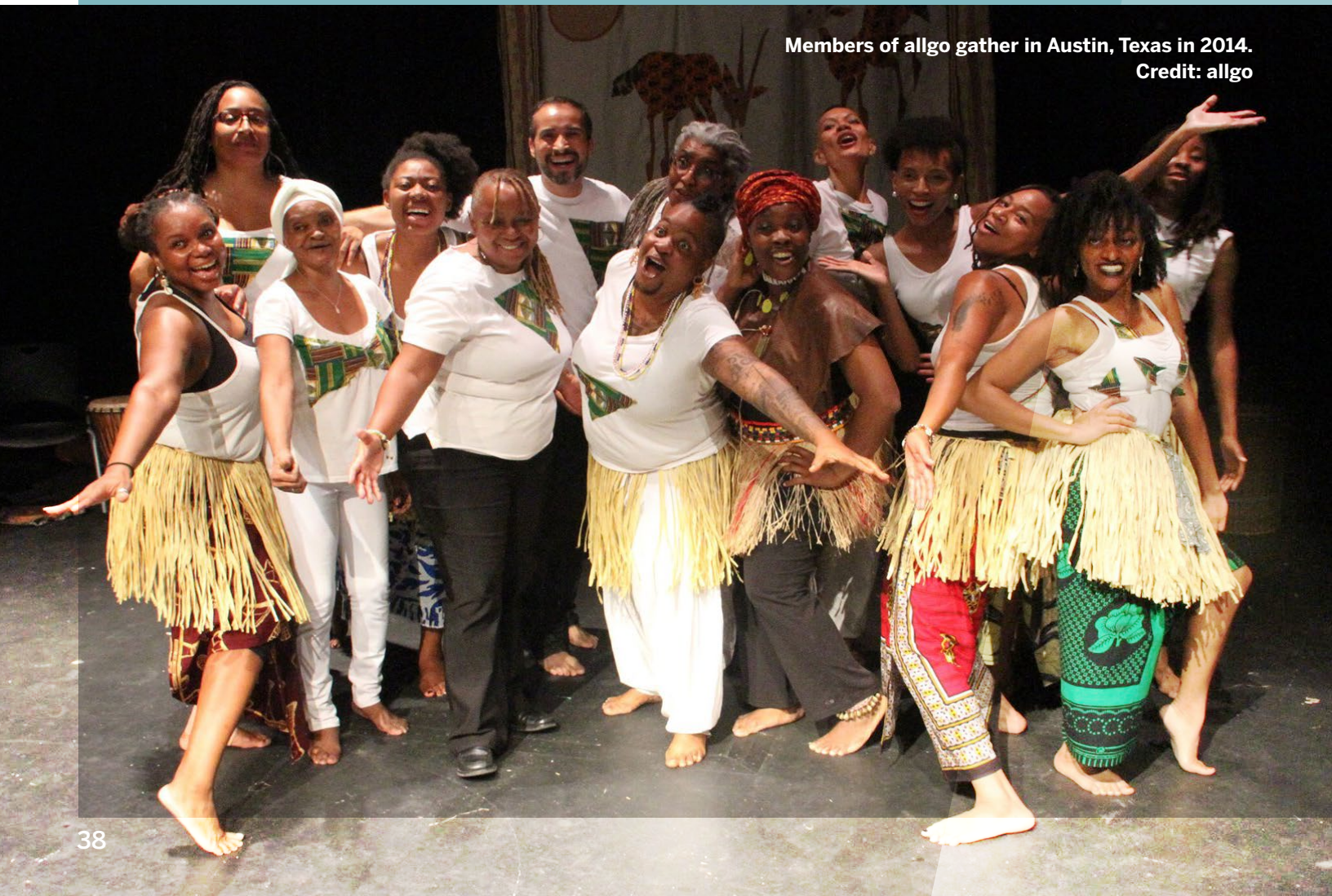
Members of aligo gather in Austin, Texas in 2014.

aligo activates its local queer People of Color (QPOC) community through intersecting art, health through wellness, and social justice programming. aligo brings a holistic multi-faceted approach to their work by investing not only in community activism, but also highlighting artistic ability, healing, and cultural product as activism. In keeping their work hyper-local and Texas focused, aligo serves as a model for other local groups across the country to commit to increasing social justice awareness. They have doubled down on their efforts to provide community-first spaces, such as artistic showcases and wellness clinics, which continue to sustain multi-issue activism across the state. Astraea supports aligo through our Funding Queerly Giving Circle which is housed at Astraea.