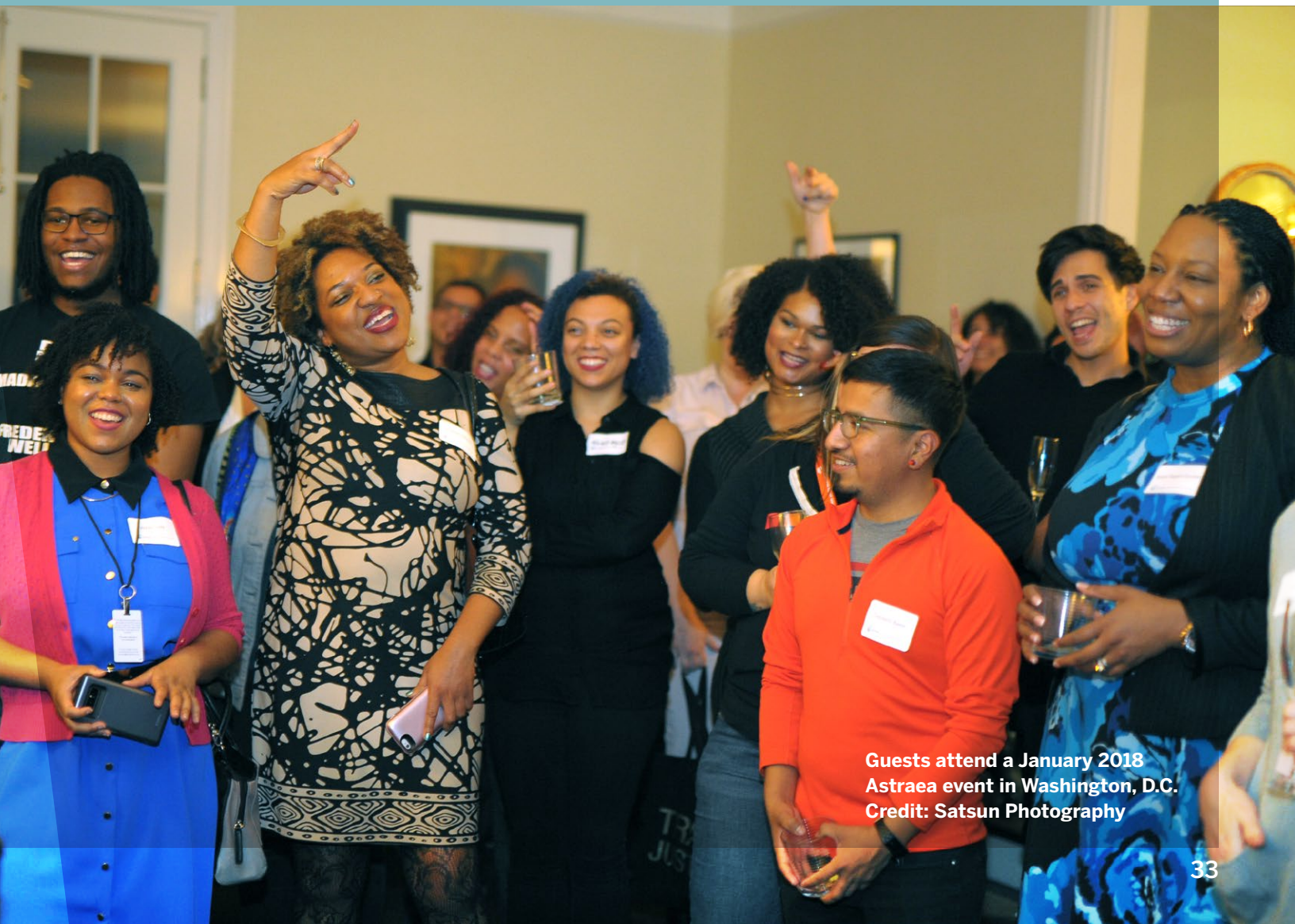
Guests attend a January 2018 Astraea event in Washington, D.C.