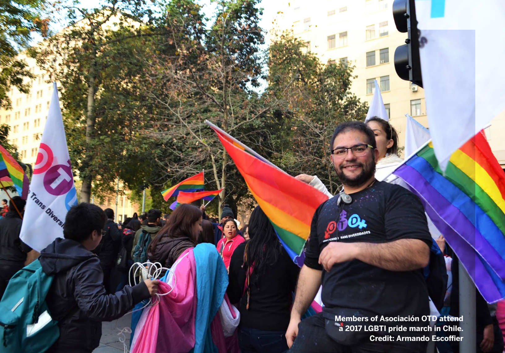
Members of Asociación OTD attend a 2017 LGBTI pride march in Chile.