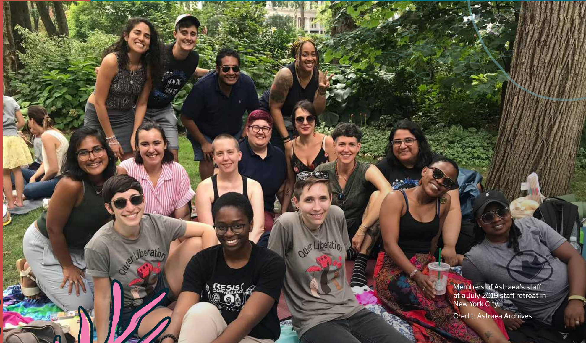
Members of Astraea's staff at a July 2019 staff retreat in New York City.