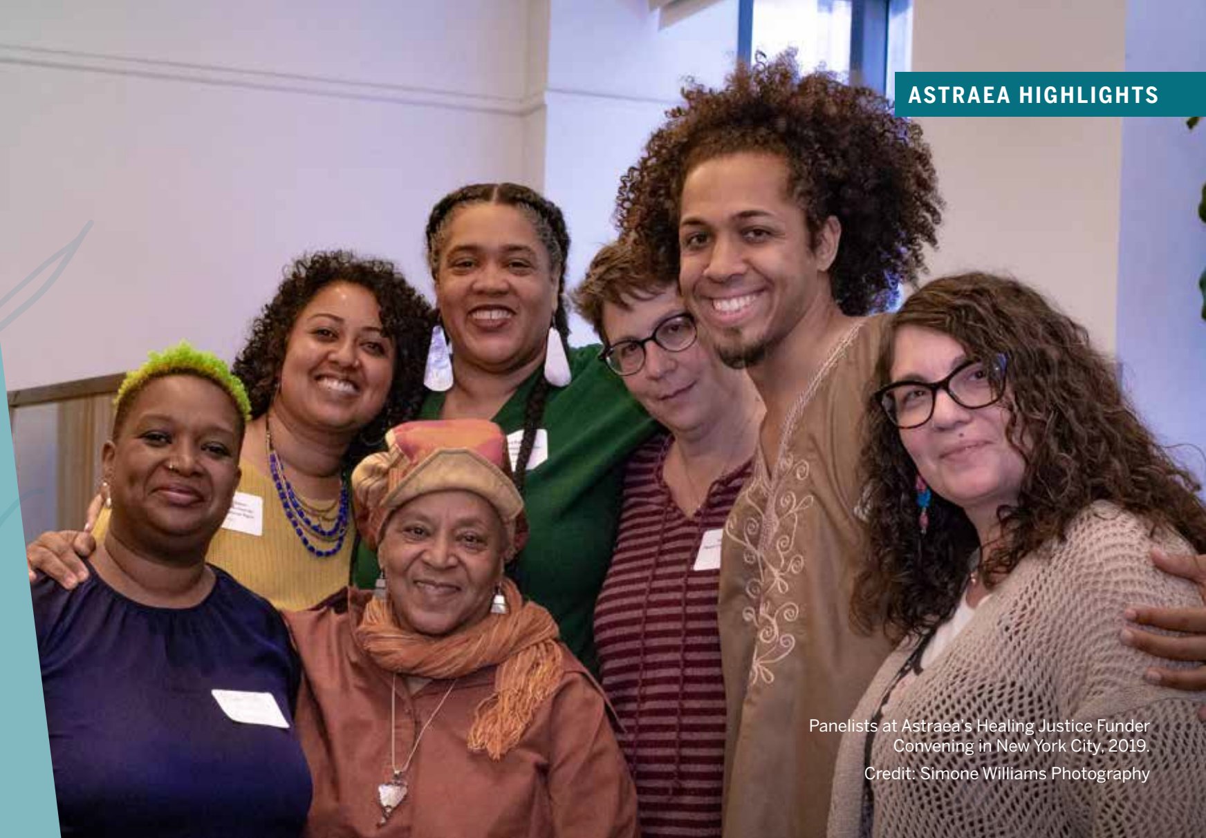
Panelists at Astraea's Healing Justice Funder Convening in New York City, 2019.

Here are just some of the ways we've shown up for our movements in 2019: