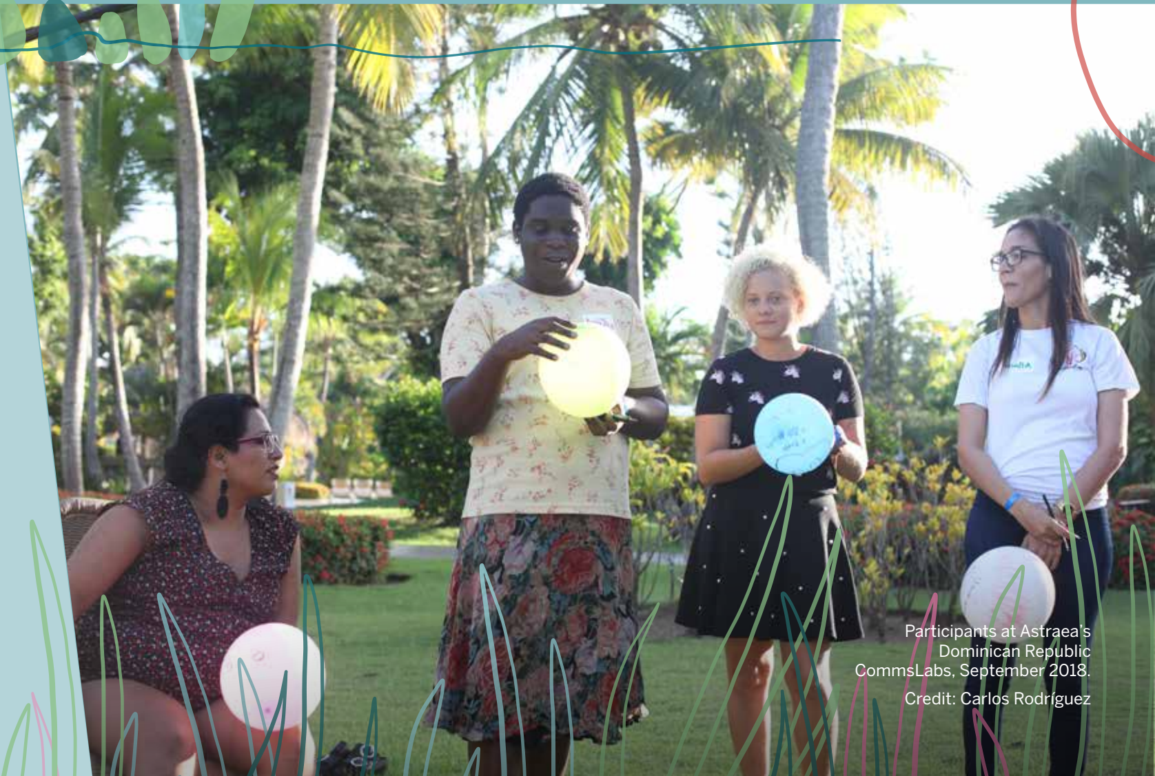
Participants at Astraea's Dominican Republic CommsLabs, September 2018.

Our Feminist Funding Principles publication launched in May 2019, offering 10 feminist-based recommendations to funders to support movements in sustainable ways. The principles are a call-to-action for the philanthropy community to redistribute money as a mechanism towards redistributing power, so that ultimately movement agendas are controlled by grassroots activists, organizations, and communities.