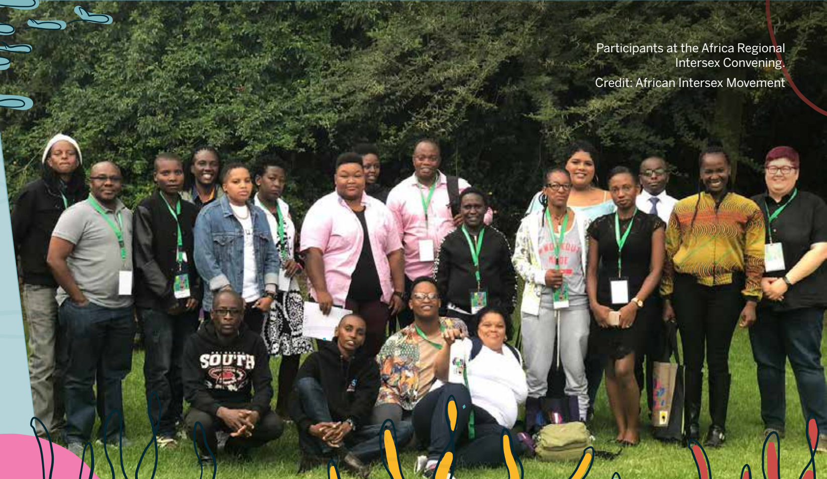
Participants at the Africa Regional Intersex Convening.

In May 2019, we co-hosted a “Freedom from Violence and Criminalization Gathering” for U.S. and Puerto Rico-based grantee partners along with Borealis Philanthropy in San Juan, Puerto Rico. From transformative justice and budget advocacy sessions led by organizers, to rich cultural programming and holistic wellness offerings from local Puerto Rican practitioners and organizers, the convening offered a generative space for participants to continue building connections and deepening their visions for what safety and justice look like in communities of color in the U.S and in Puerto Rico.