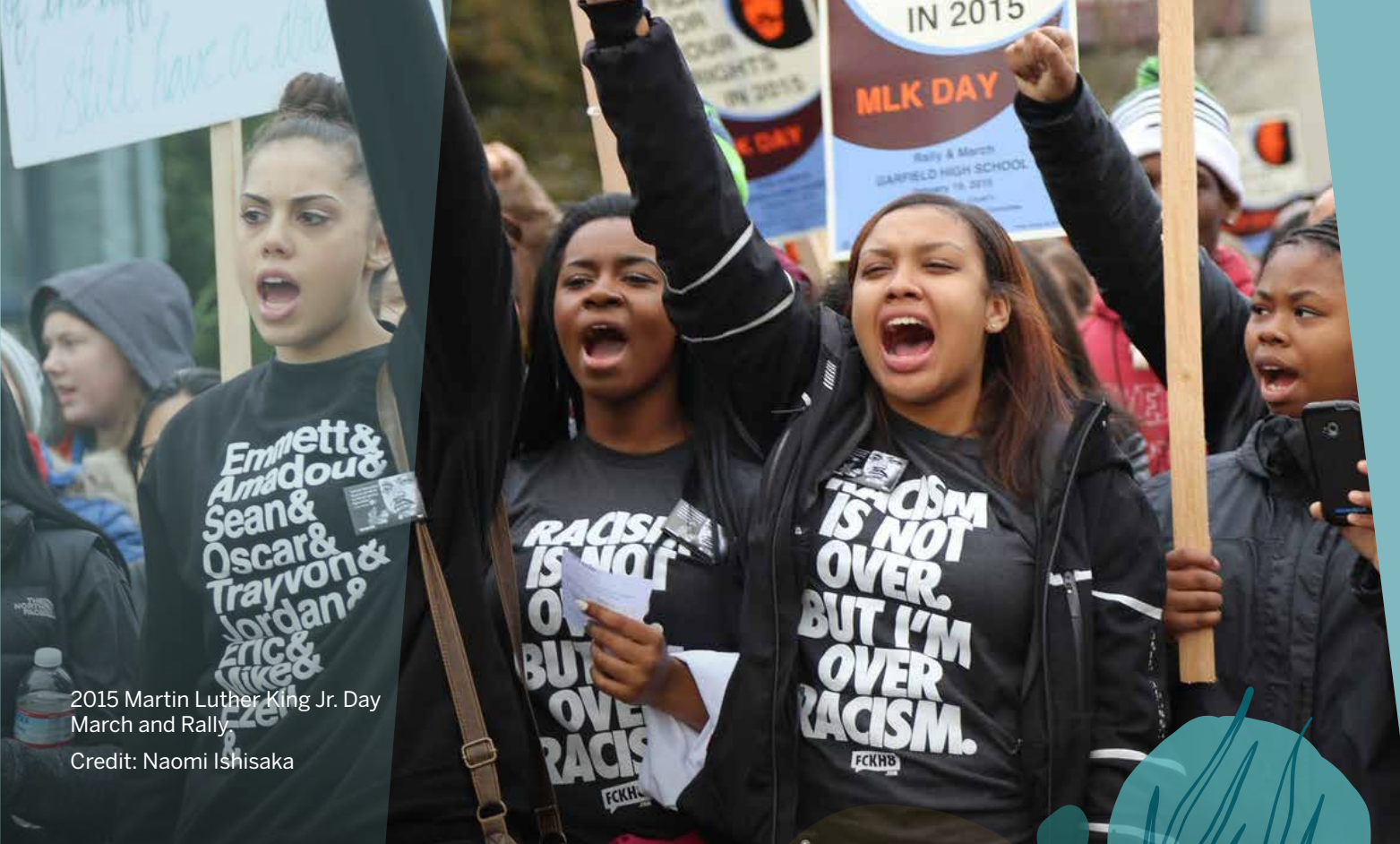
2015 Martin Luther King Jr. Day March and Rally

Our 4th CommsLabs convening took place in Punta Cana in the Dominican Republic, bringing together activists from around the Latin America and Caribbean regions. It was an opportunity for LGBTQI activists from all over the region to build capacity, experiment with new tools and technologies, and intentionally connect with each other to break down the structures of racism, patriarchy, and colonialism.