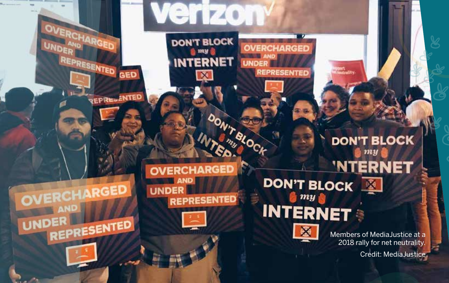
Members of MediaJustice at a 2018 rally for net neutrality.

protested violence against LGBTQI communities in Palestine. After a trans teenager was stabbed because of their sexuality, Palestinian civil society organizations—including Aswat and alQaws—released a statement expressing their solidarity with the victim and strongly condemning violence against LGBTQI and non-binary individuals. A historic protest, the first of its kind, followed in Haifa, in which activists expressed their commitment to fighting for personal freedoms—including gender identity and sexual orientation—as an integral part of the struggle for liberation and decolonization.