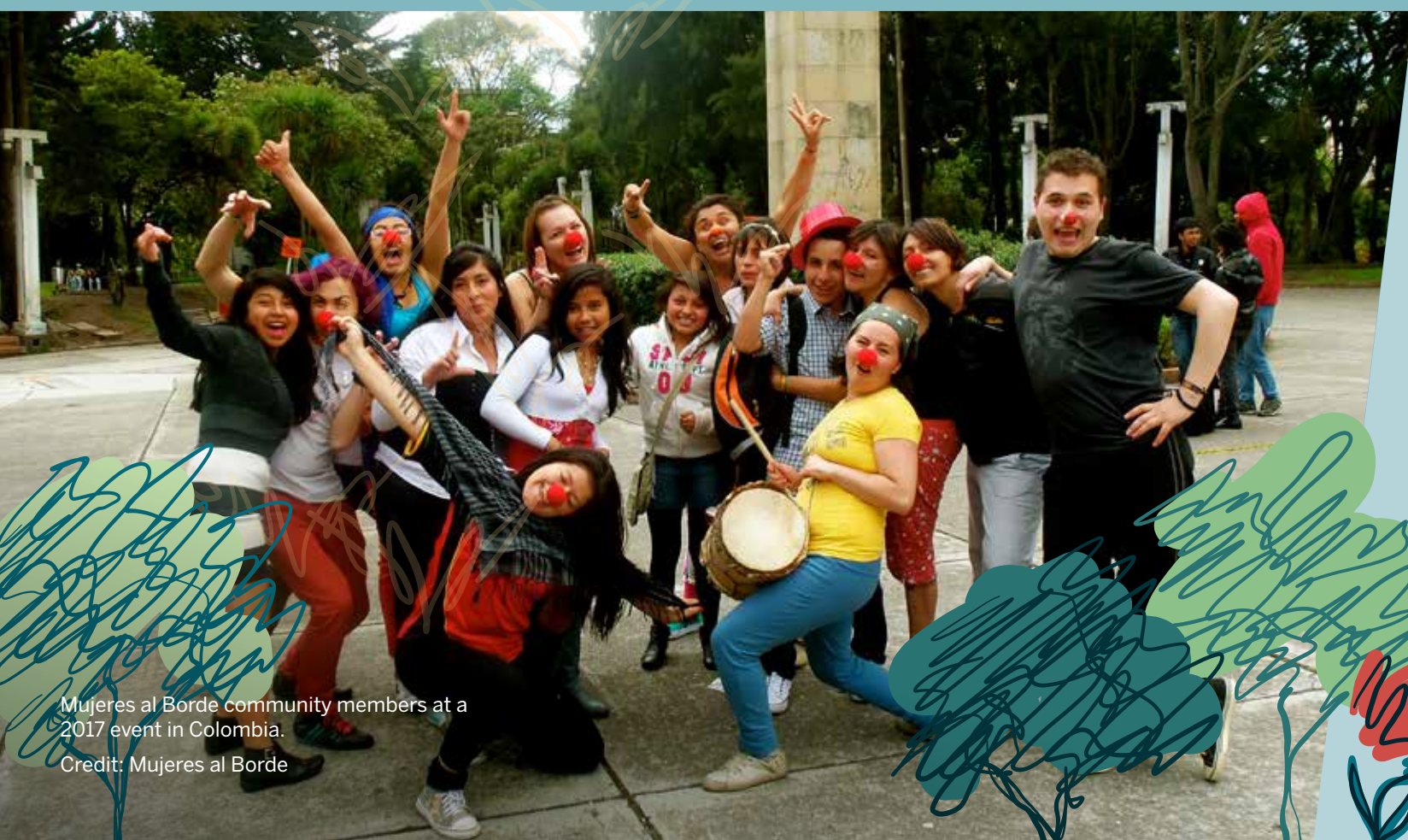
Mujeres al Borde community members at a 2017 event in Colombia.