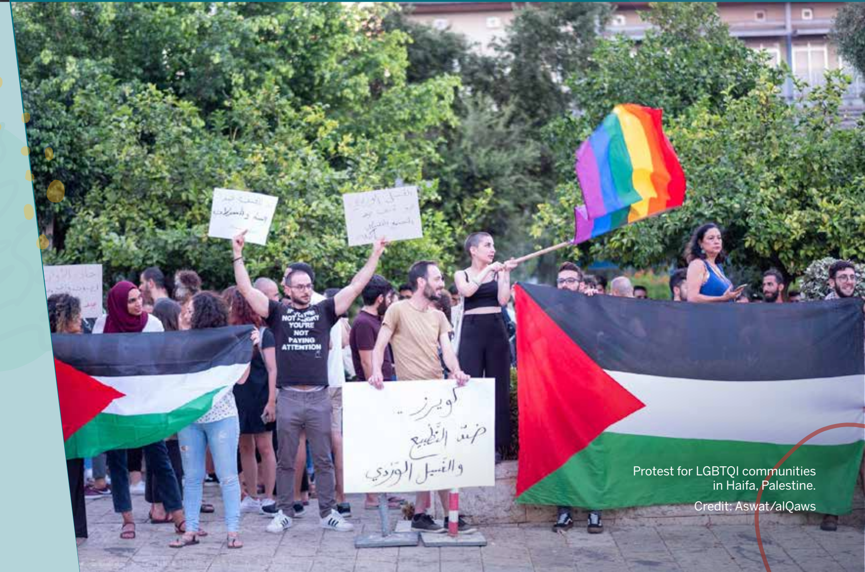
Protest for LGBTQI communities in Haifa, Palestine.

is fighting for digital rights and privacy for all! MediaJustice joined 34 civil rights, consumer, and privacy organizations from the U.S. in launching public interest principles for robust and comprehensive federal legislation. These guidelines would ensure fairness, prevent discrimination, advance equal opportunity, protect free expression, and hold companies that collect personal data accountable for privacy violations.