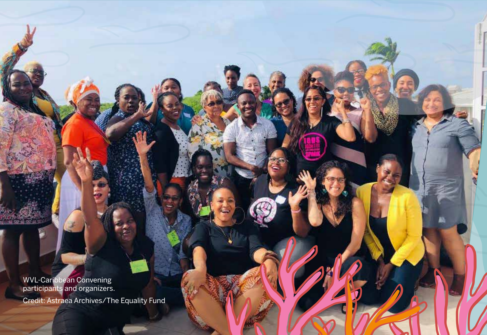
WVL-Caribbean Convening participants and organizers.