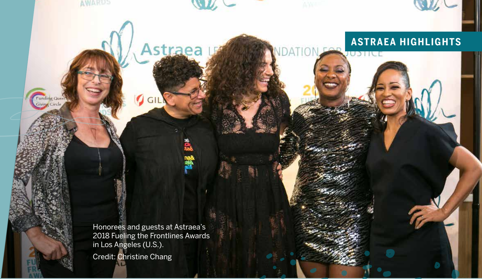
Honorees and guests at Astraera's 2018 Fueling the Frontlines Awards in Los Angeles (U.S.).

This year, we launched our first set of International Fertile Ground Fund grants, many of which support the strengthening of regional networks and growing global cross-movement collaborations. The Fertile Ground Fund is a flexible funding source that provides resources based on the shifting needs and desires of grantee partners, giving them the ability to be more nimble and responsive. One of our grants supported the organization of the second European Lesbian* Conference in Kyiv, Ukraine, attended by over 300 LBQ activists and allies.