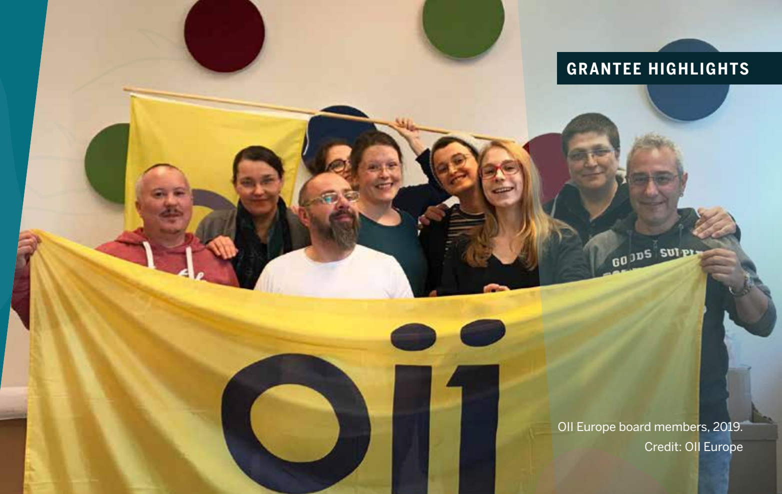
Oii Europe board members, 2019.