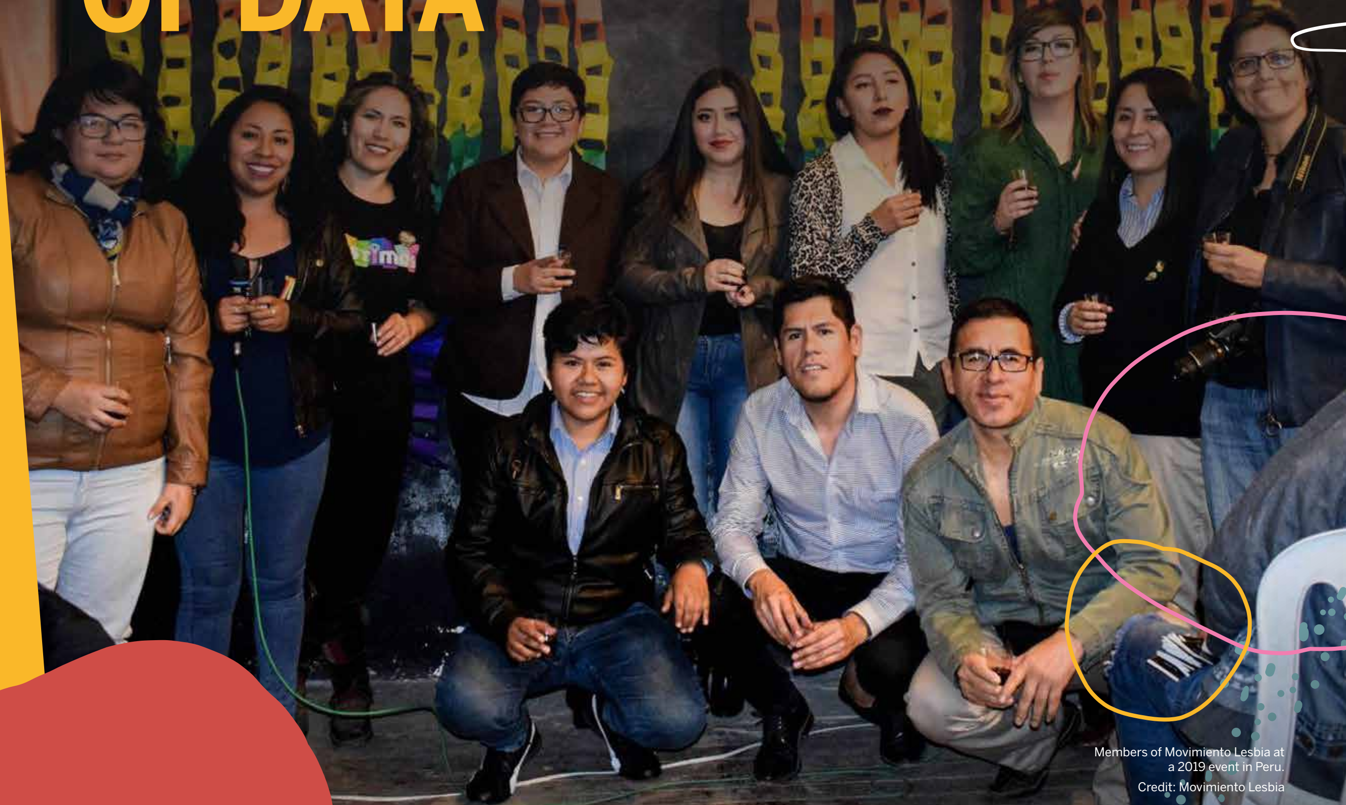
Members of Movimiento Lesbia at a 2019 event in Peru.