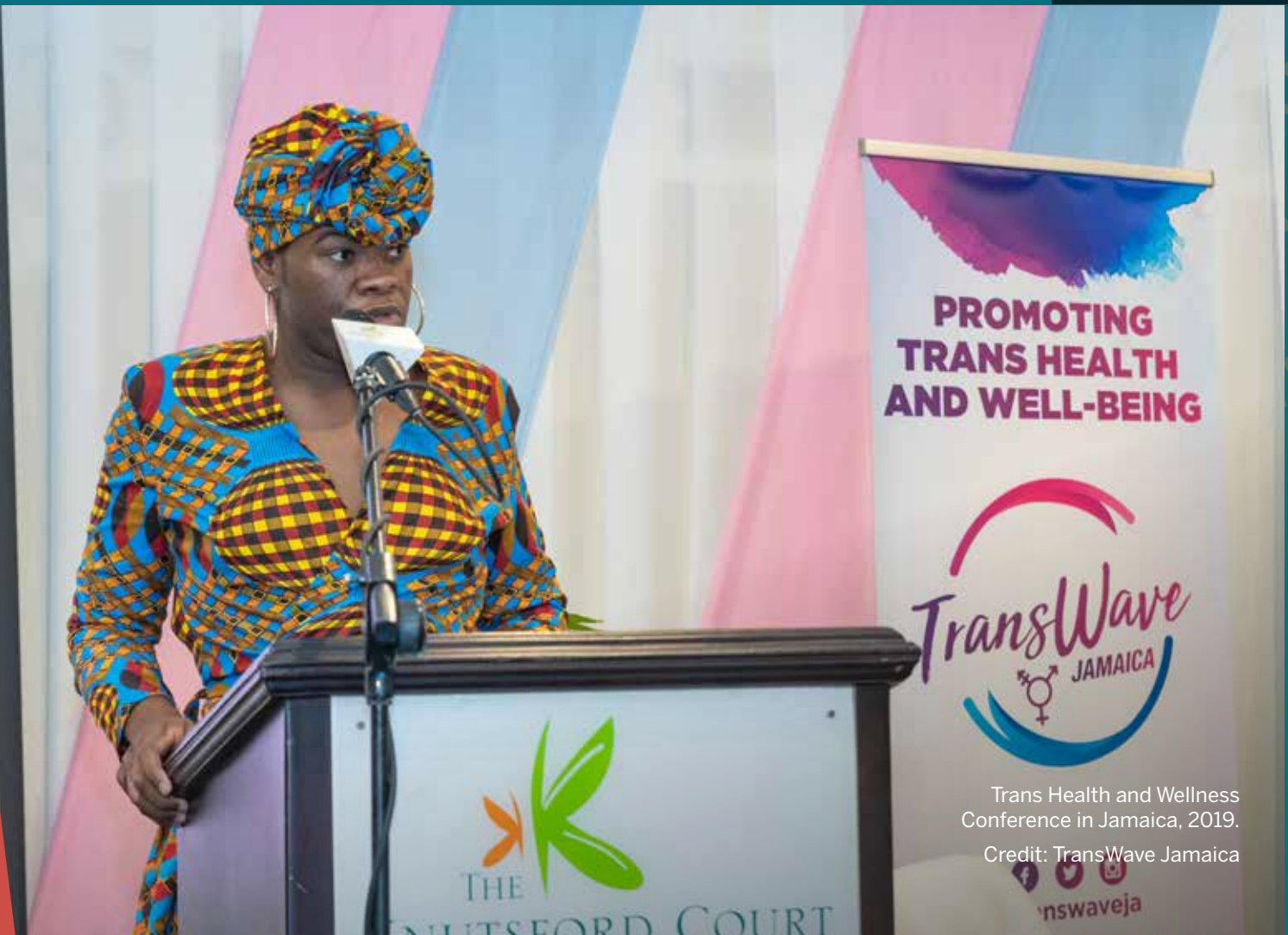
Trans Health and Wellness Conference in Jamaica, 2019.

Our grantees build power in a myriad of creative, dynamic ways which come together to create powerful organizing ecosystems. These ecosystems are blossoming and taking root around the world to work towards our collective liberation. From producing critical research highlighting ongoing violence against LGBTQI communities to creating films celebrating queer love in all its forms, our grantee partners are constantly working to create brighter, stronger futures for our people everywhere. Here are just a few of the incredible highlights of grantees' work in 2019: