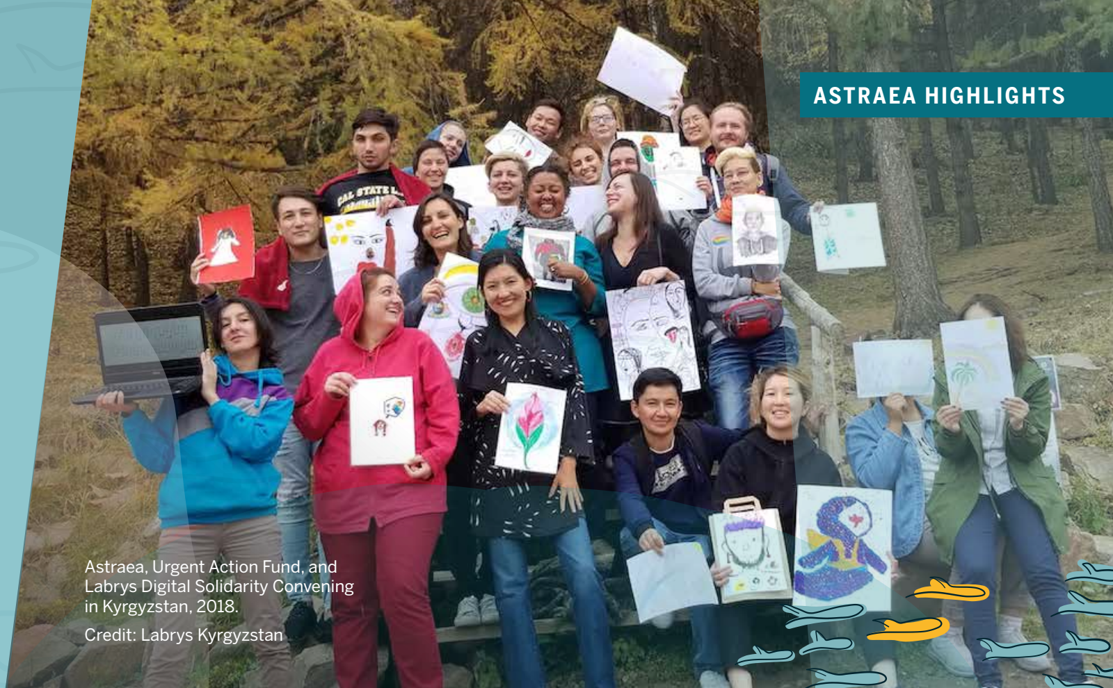
Astraea, Urgent Action Fund, and Labrys Digital Solidarity Convening in Kyrgyzstan, 2018.

The Equality Fund and Astraea hosted a two day convening to kick-off our new collaboration as part of the Women's Voice and Leadership-Caribbean (WVL) initiative. We gathered 25 partners and representatives from women's organizations and LGBTQI groups from around the region to develop and expand the thinking around the program and ensure it responds to the priorities of groups in the region. The five year initiative for the region is supported by the Government of Canada through Global Affairs Canada (GAC).