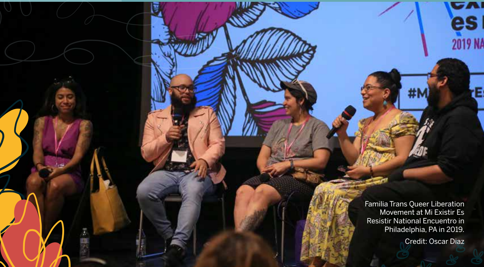
Familia Trans Queer Liberation Movement at Mi Existir Es Resistir National Encuentro in Philadelphia, PA in 2019.

is fighting the technology industry's involvement in the U.S. criminal justice system and immigration enforcement. Mijente convened a conference bringing together directly impacted communities with policy, advocacy, and legal organizations, as well as tech industry workers. The purpose of the conference was to organize against the tech industry's deep involvement in state-led surveillance and information sharing of migrants and People of Color, and the detention and deportation of immigrants.