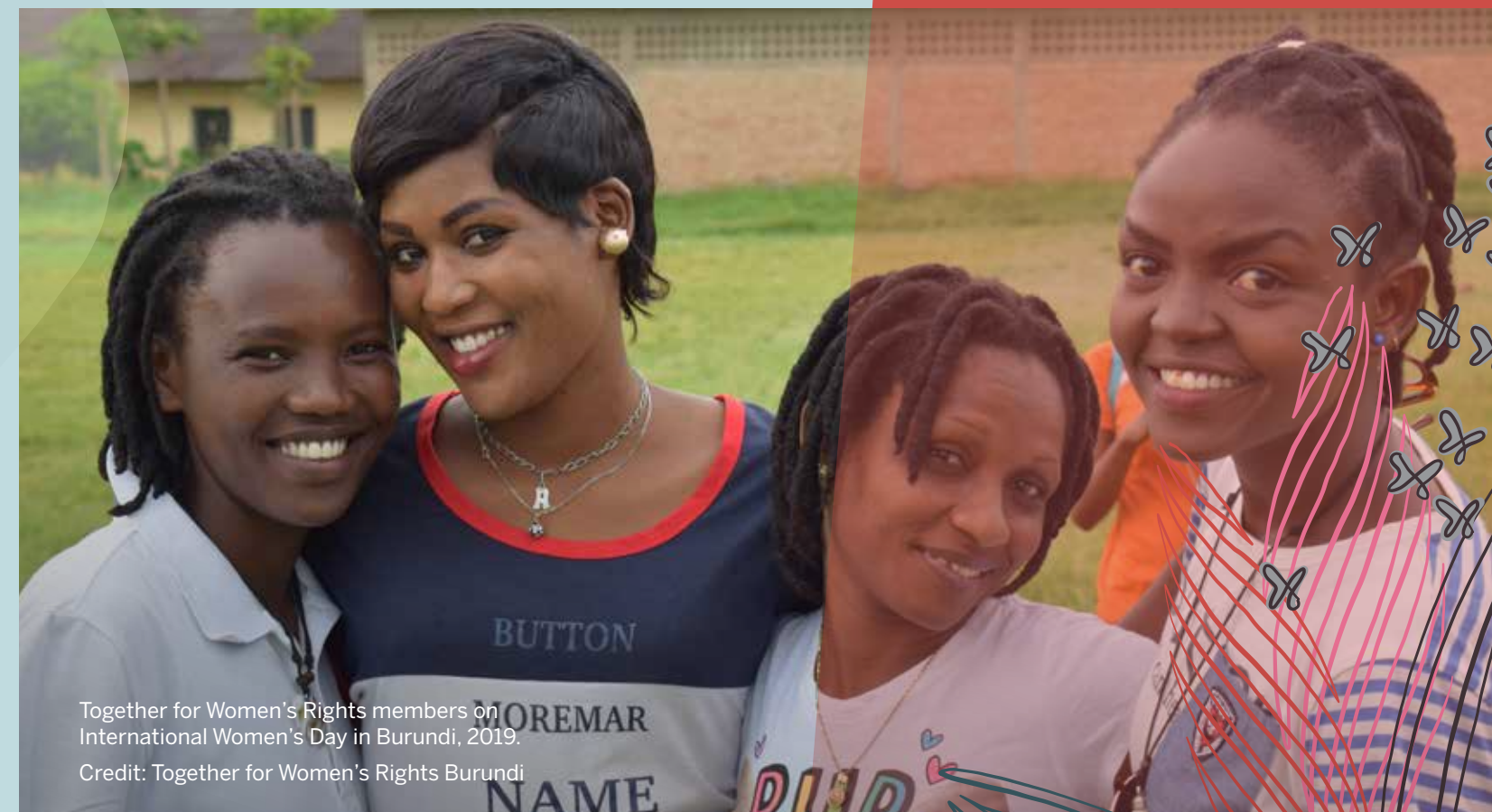
Together for Women's Rights members on International Women's Day in Burundi, 2019.

established Arequipa, Peru's first ever "LGBTI Week of Remembrance," which commemorated and visibilized the memories and histories of LGBTI communities in the country through films, conversations, and art performances highlighting both the achievements and ongoing struggles of LGBTI communities.