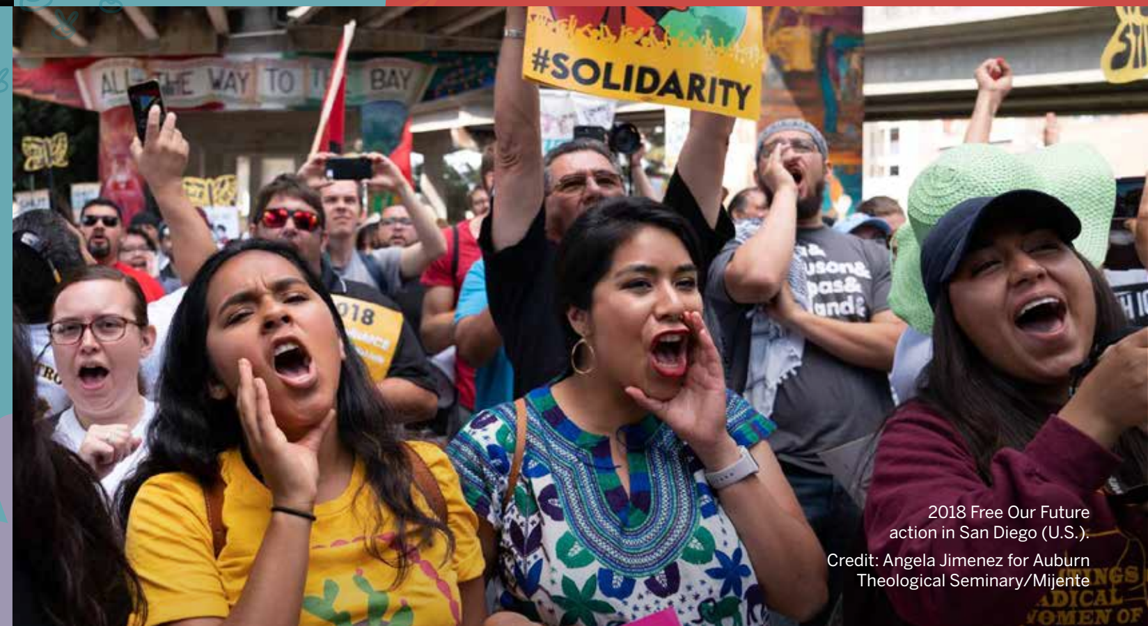
2018 Free Our Future action in San Diego (U.S.).

celebrated their fifth anniversary in 2019 by launching “Mi Existir Es Resistir National Encuentro” with more than 200 trans, queer, and gender non-conforming Latinx community members in attendance from across the United States and abroad. The gathering was an opportunity to share their “art, medicine, strategies, dreams, dances, and laughter to create a more just world.”