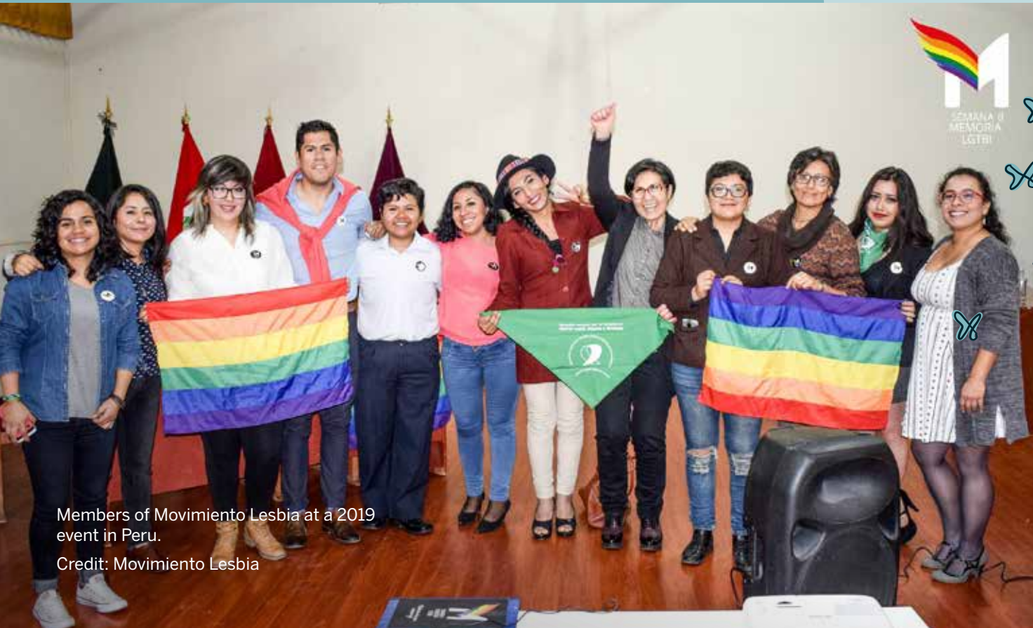
Members of Movimiento Lesbía at a 2019 event in Peru.

launched an illuminating report capturing the lived realities of LBTQI women and sex workers in Burundi . It serves as a powerful advocacy tool to educate health and rights providers on the specific health access issues faced by these communities, and advocate for greater inclusion of LBTQI people in sexual and reproductive health programs.