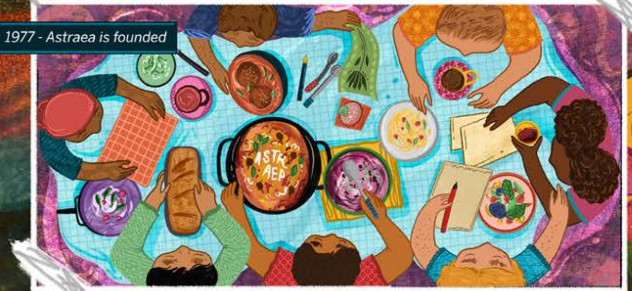
1977 - Astraea is founded