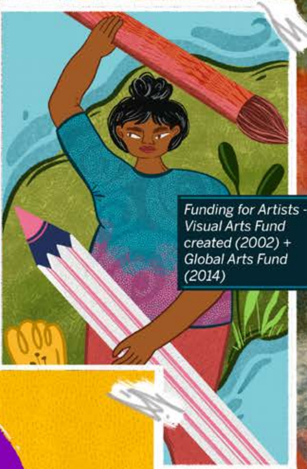
Funding for Artists - Visual Arts Fund created (2002) + Global Arts Fund (2014)