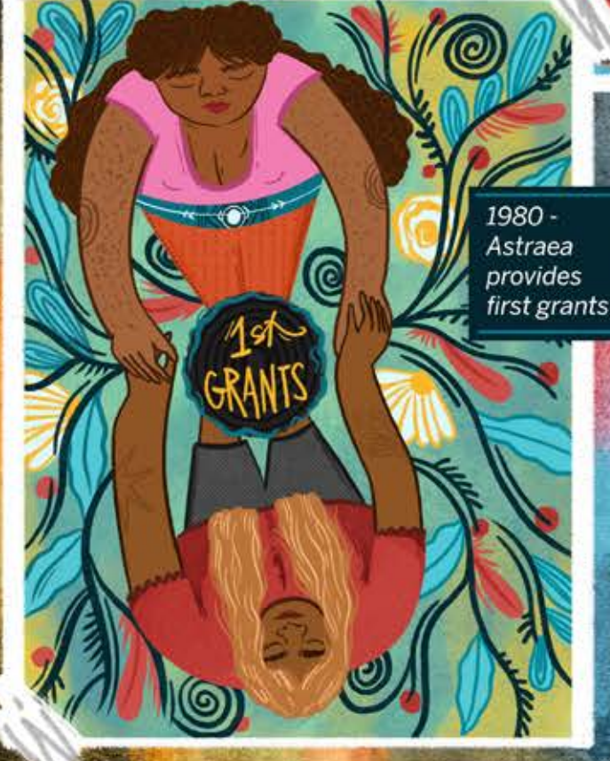
1980 - Astraea provides first grants