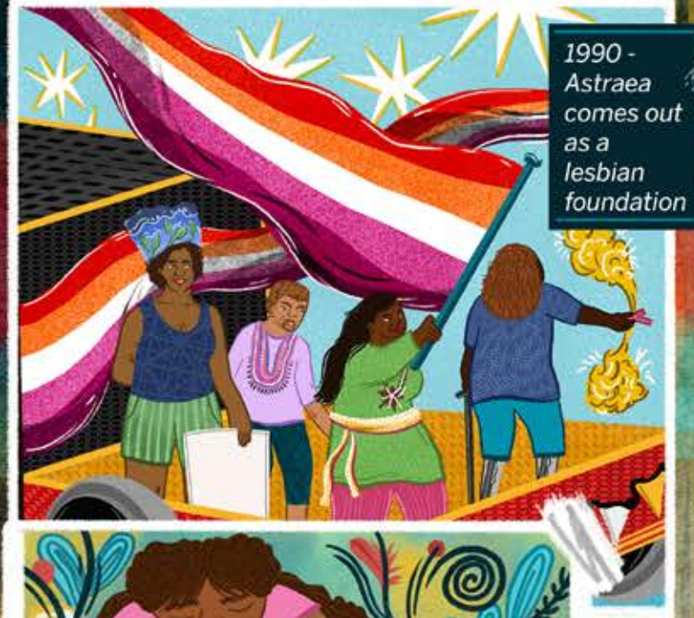
1990 - Astraea comes out as a lesbian foundation