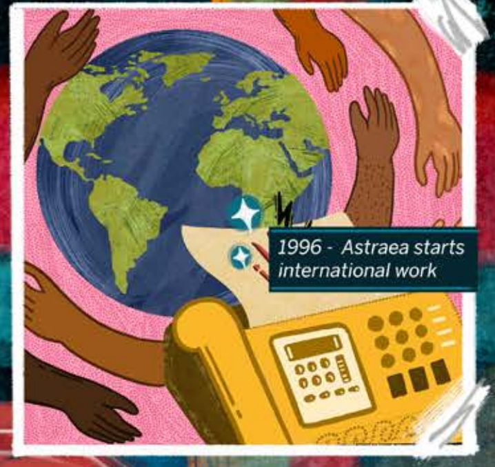
1996 - Astraea starts international work