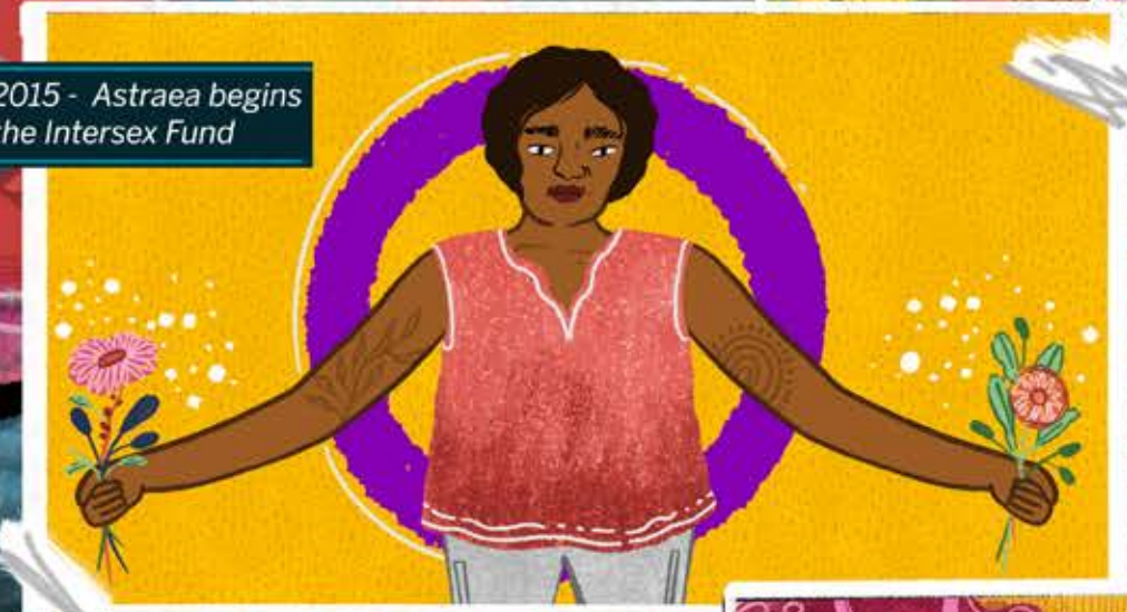
2015 - Astraea begins the Intersex Fund