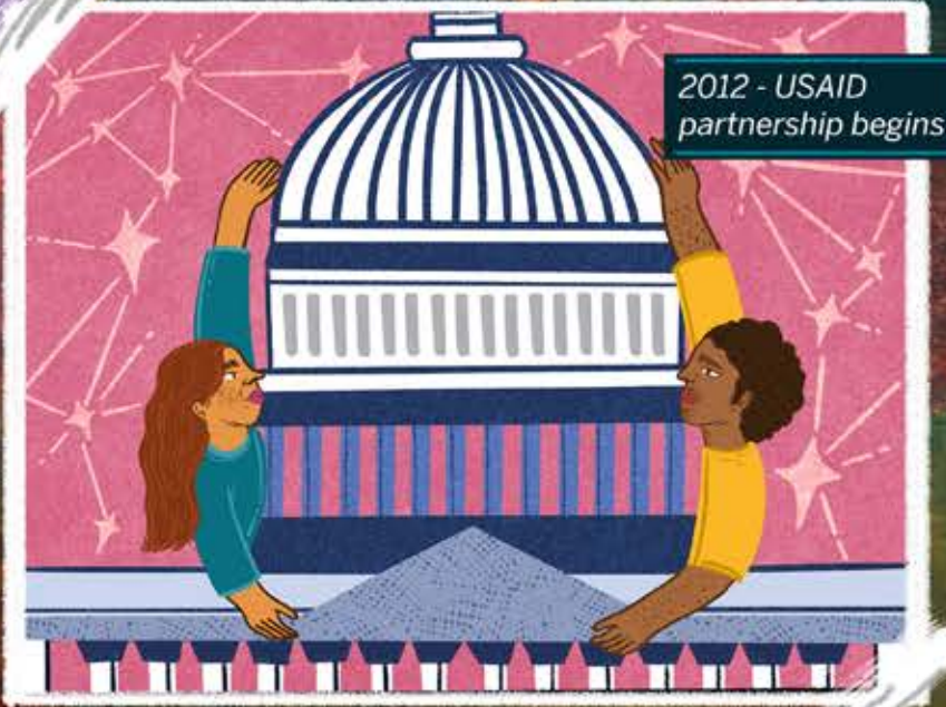
2012 - USAID partnership begins