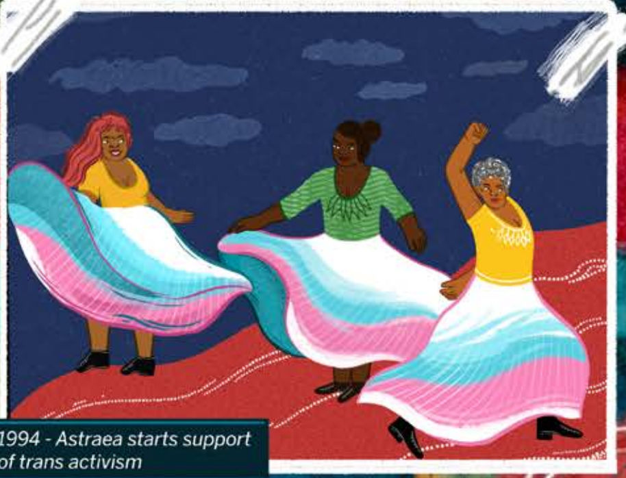
1994 - Astraea starts support of trans activism