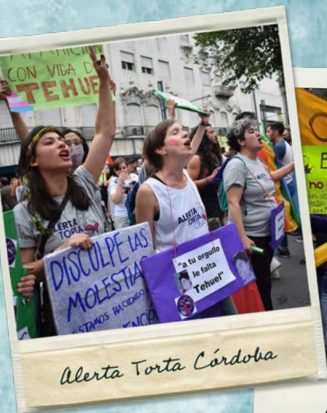
Alerta Torta Córdoba

Based in Mexico City, Agencia Presentes is the only news media focused on sexual rights and LGBTQI+ news in nine Latin American countries. It covers news such as protests and court hearings from a human rights and feminist perspective in order to combat discrimination. Agencia Presentes also hosts narrative workshops and discussions to raise the visibility of LGBTQI+ rights and inclusive approaches to reporting in mainstream journalism.